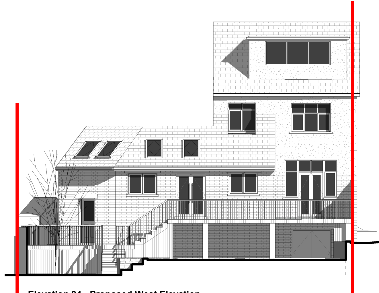
Elevation 04 - Proposed West Elevation 1 : 100