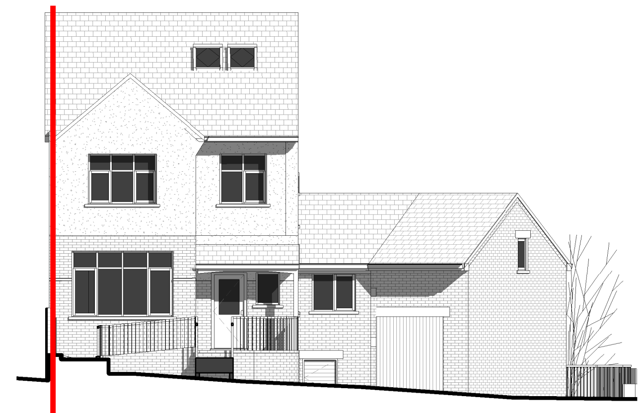
Elevation 02 - Proposed East Elevation 1 : 100