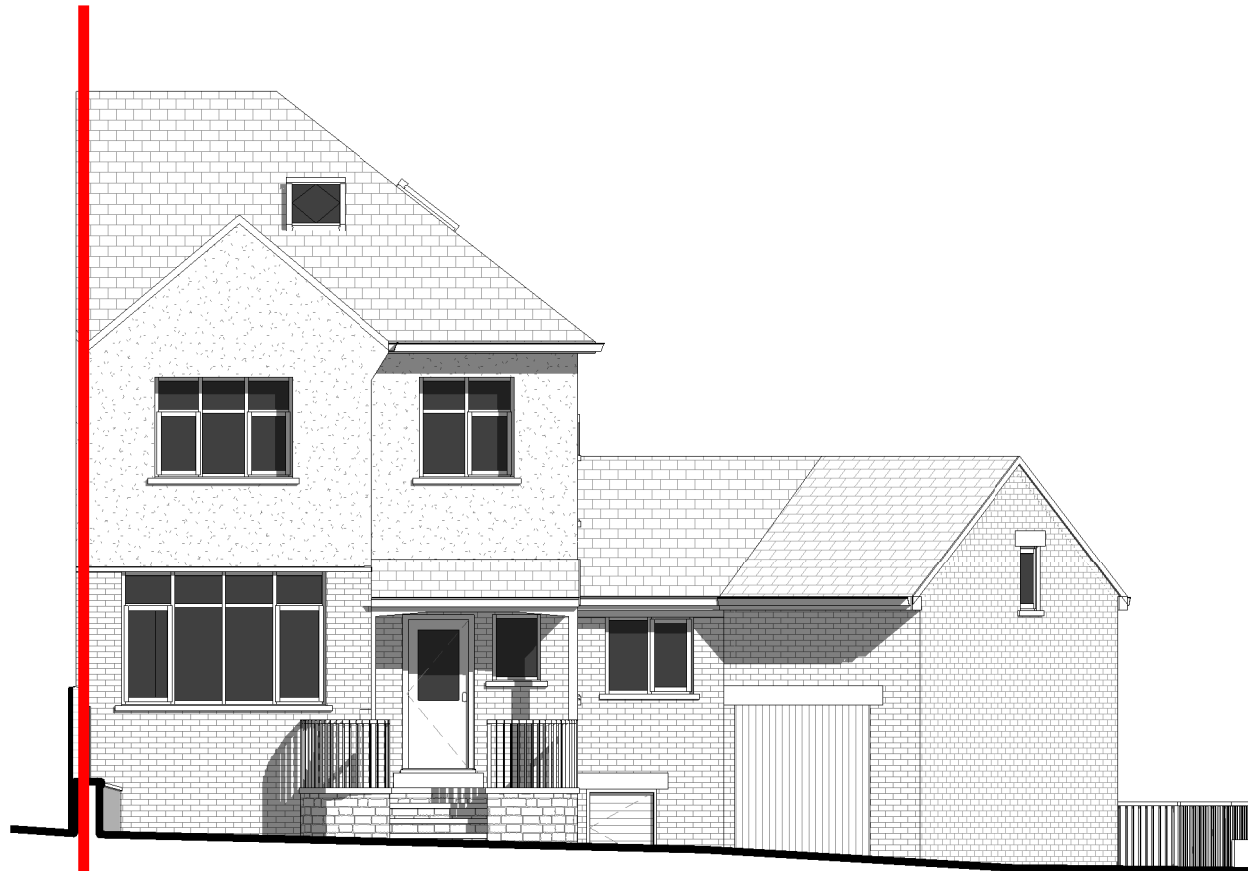
Elevation 02 - Existing East Elevation