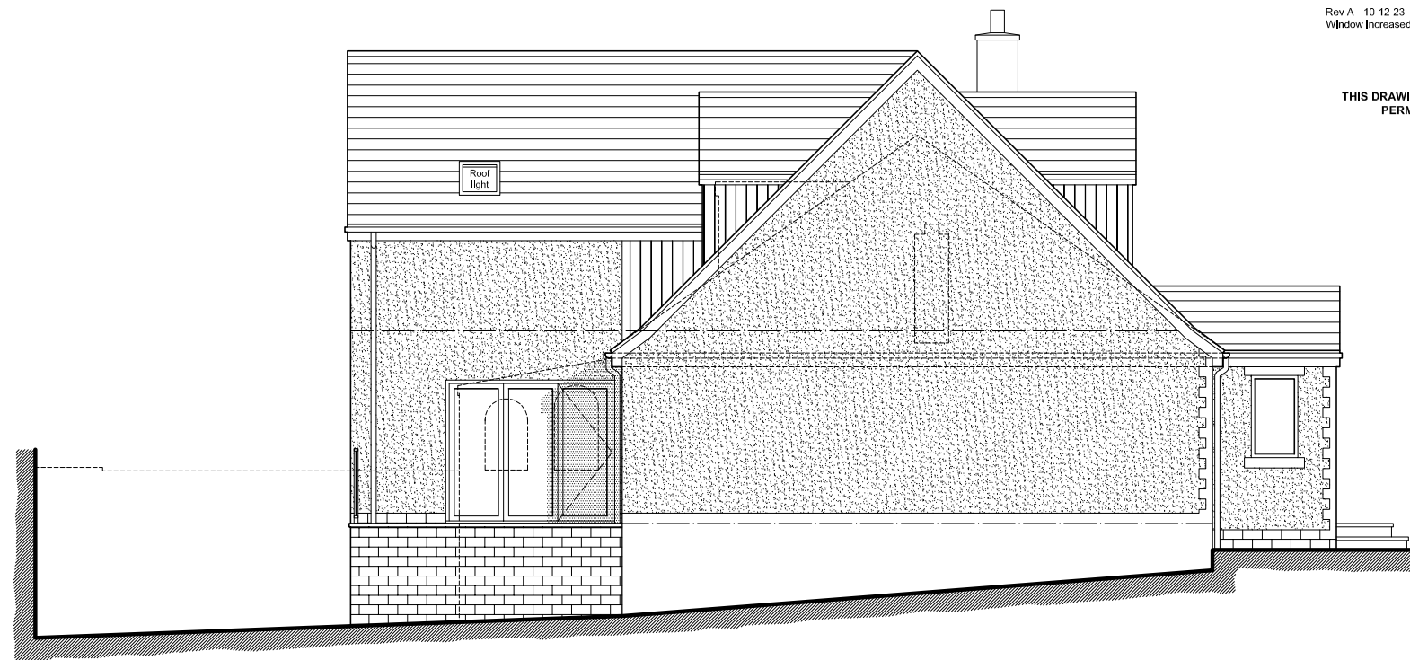
PROPOSED SIDE ELEVATION 1