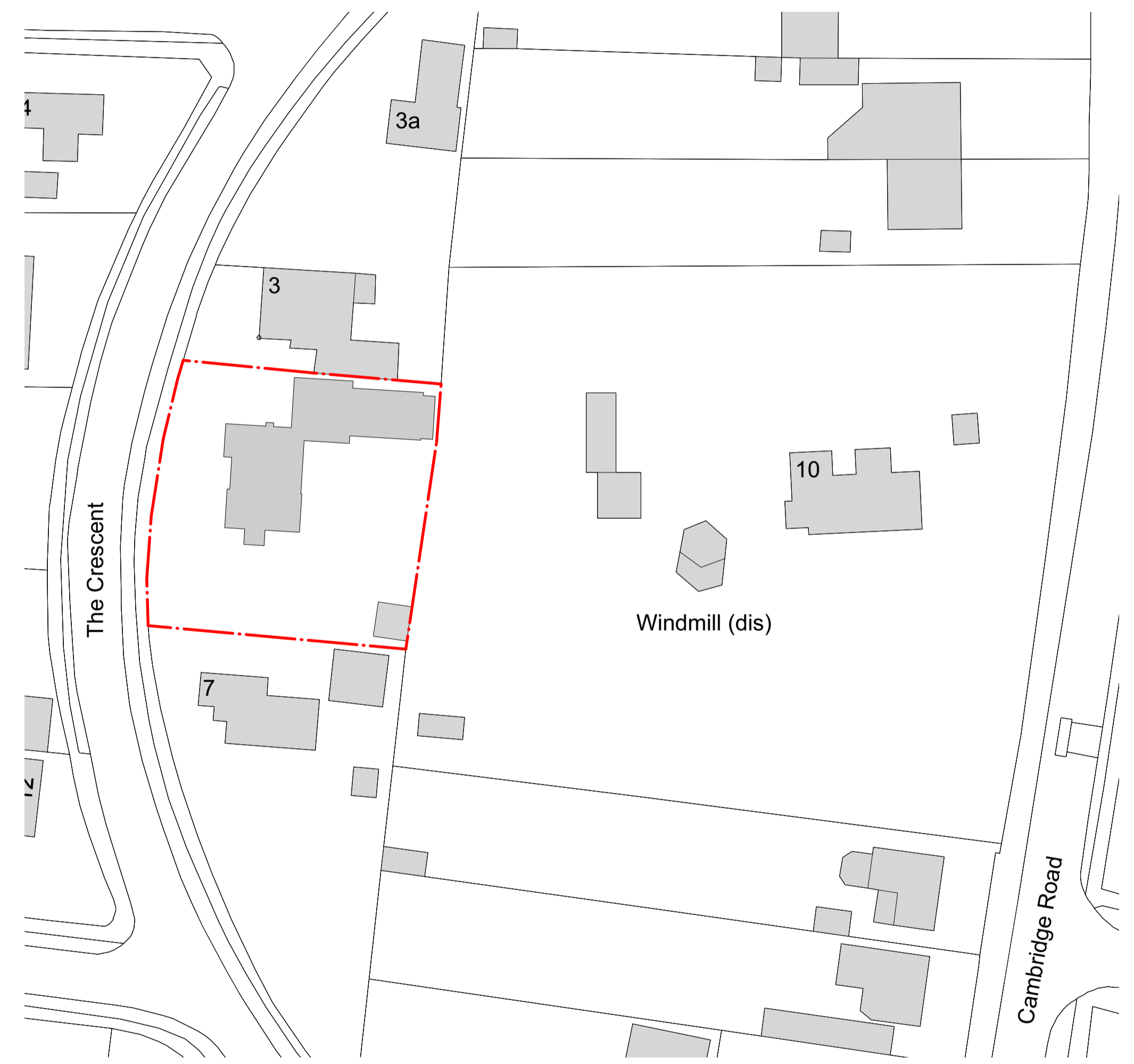
Existing Block Plan Scale: 1:500