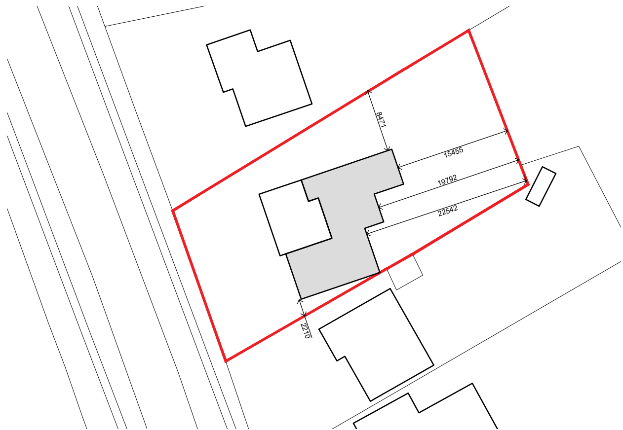
Proposed Block Plan