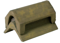
Gas flue ridge unit