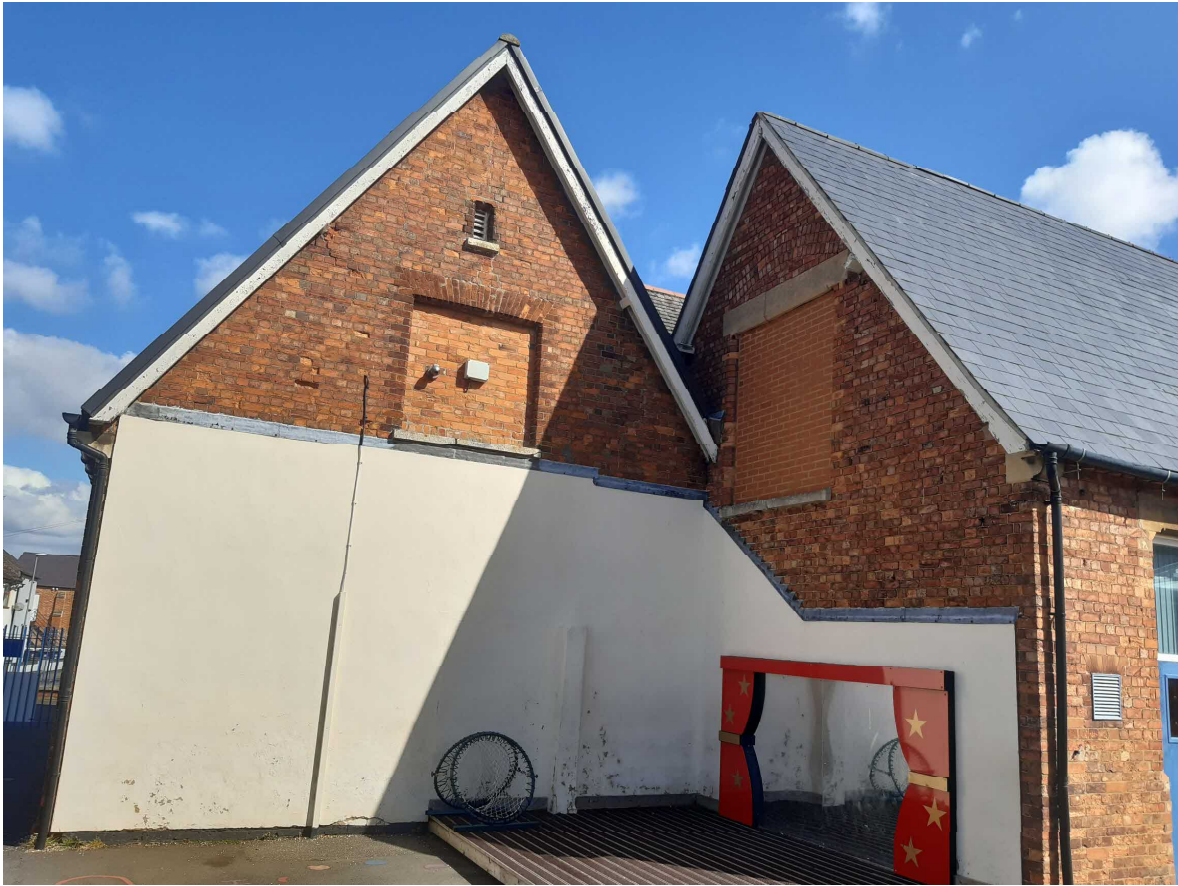
Rear elevation showing previous phase.