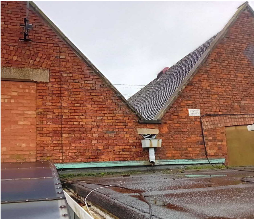
East Elevation on top of adjacent flat roof building.