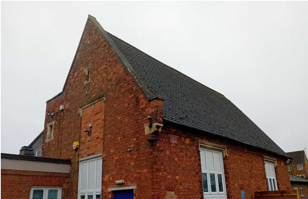
Side elevation facing west