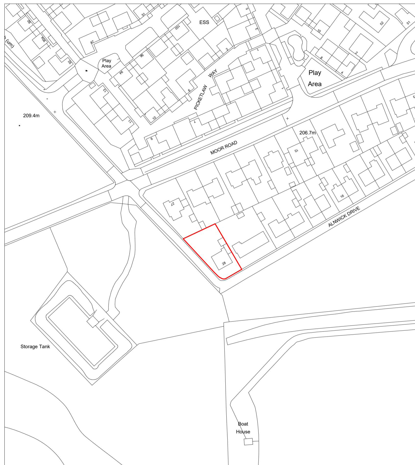
2 LOCATION PLAN - AS EXISTING 1:1250