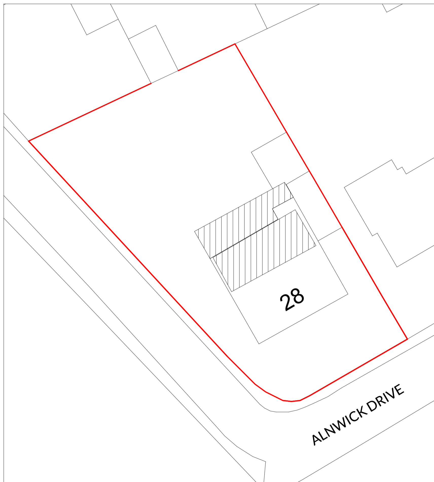
1 SITE PLAN - AS PROPOSED 1:200