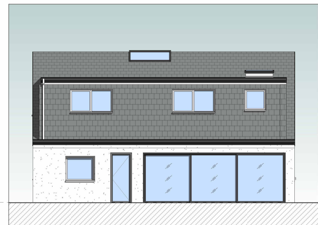
C ELEVATION C 1:100