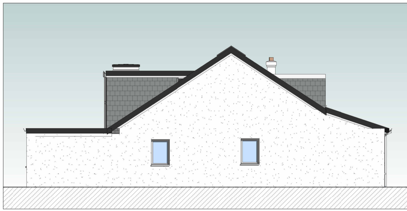
B ELEVATION B 1:100