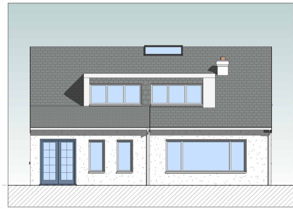
A ELEVATION A 1:100