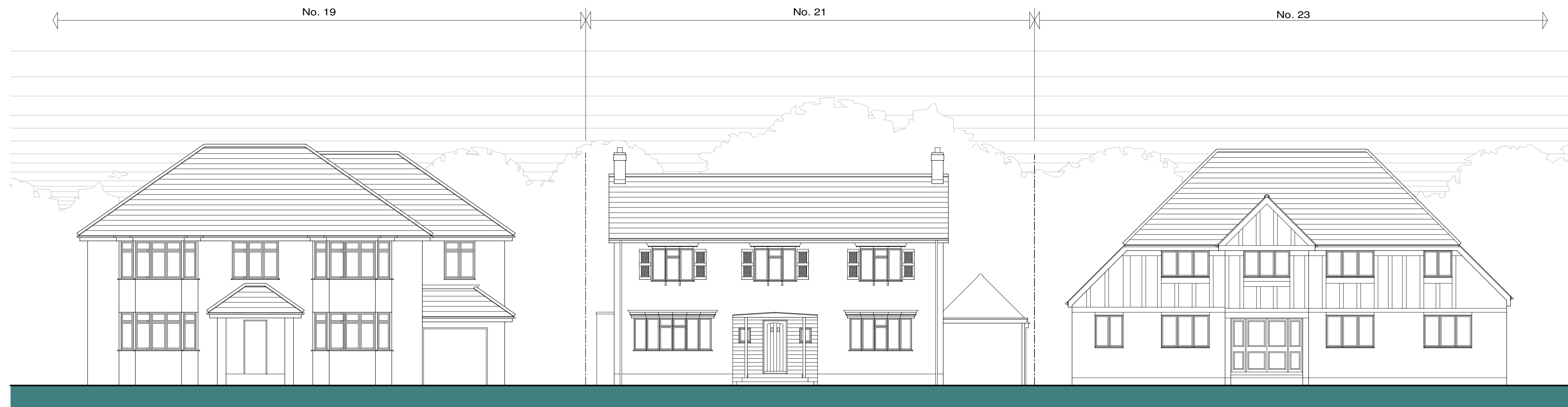
existing street elevation