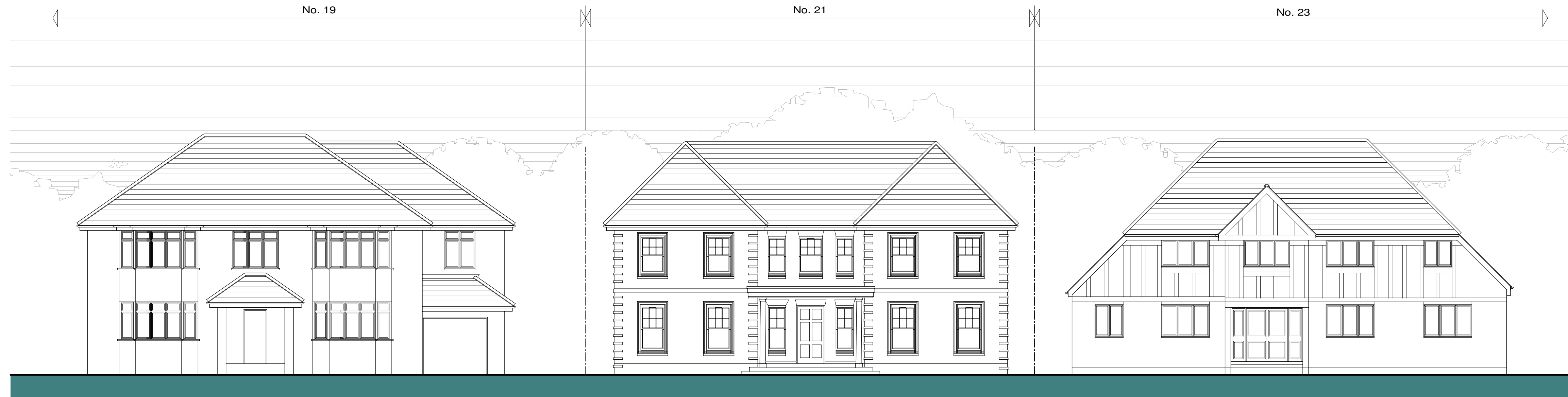
proposed street elevation