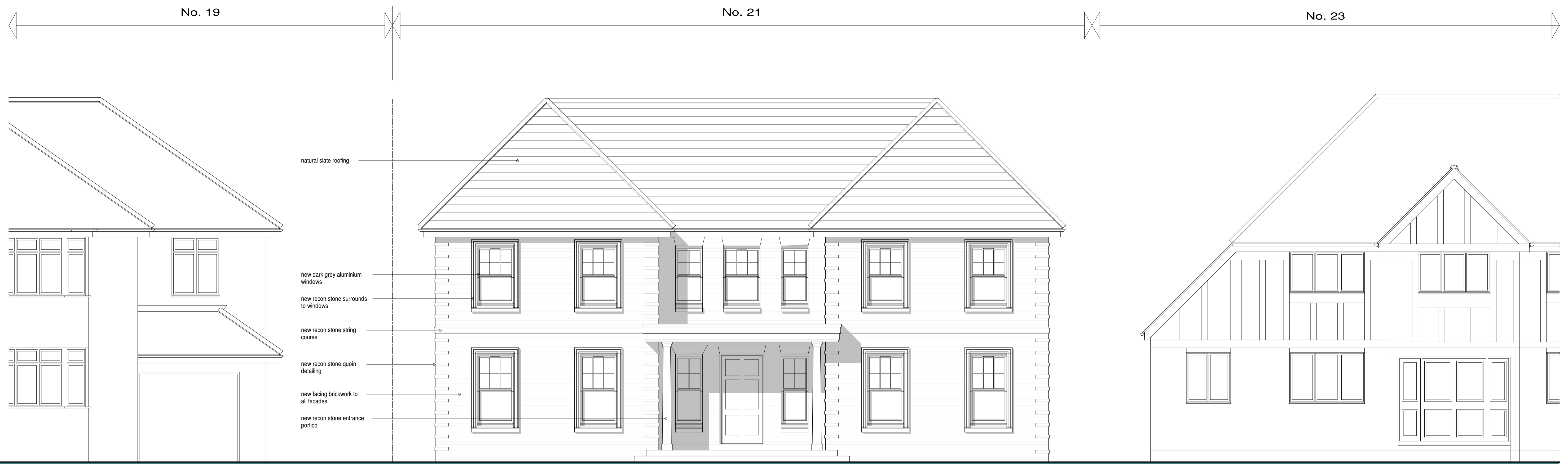
proposed front elevation