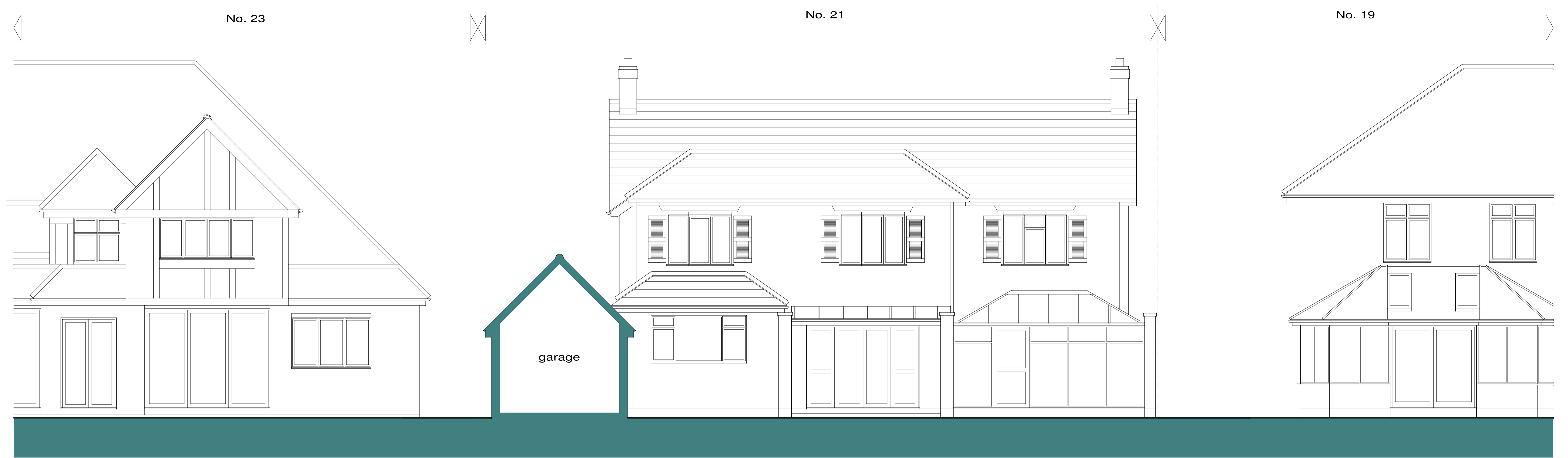
existing rear elevation