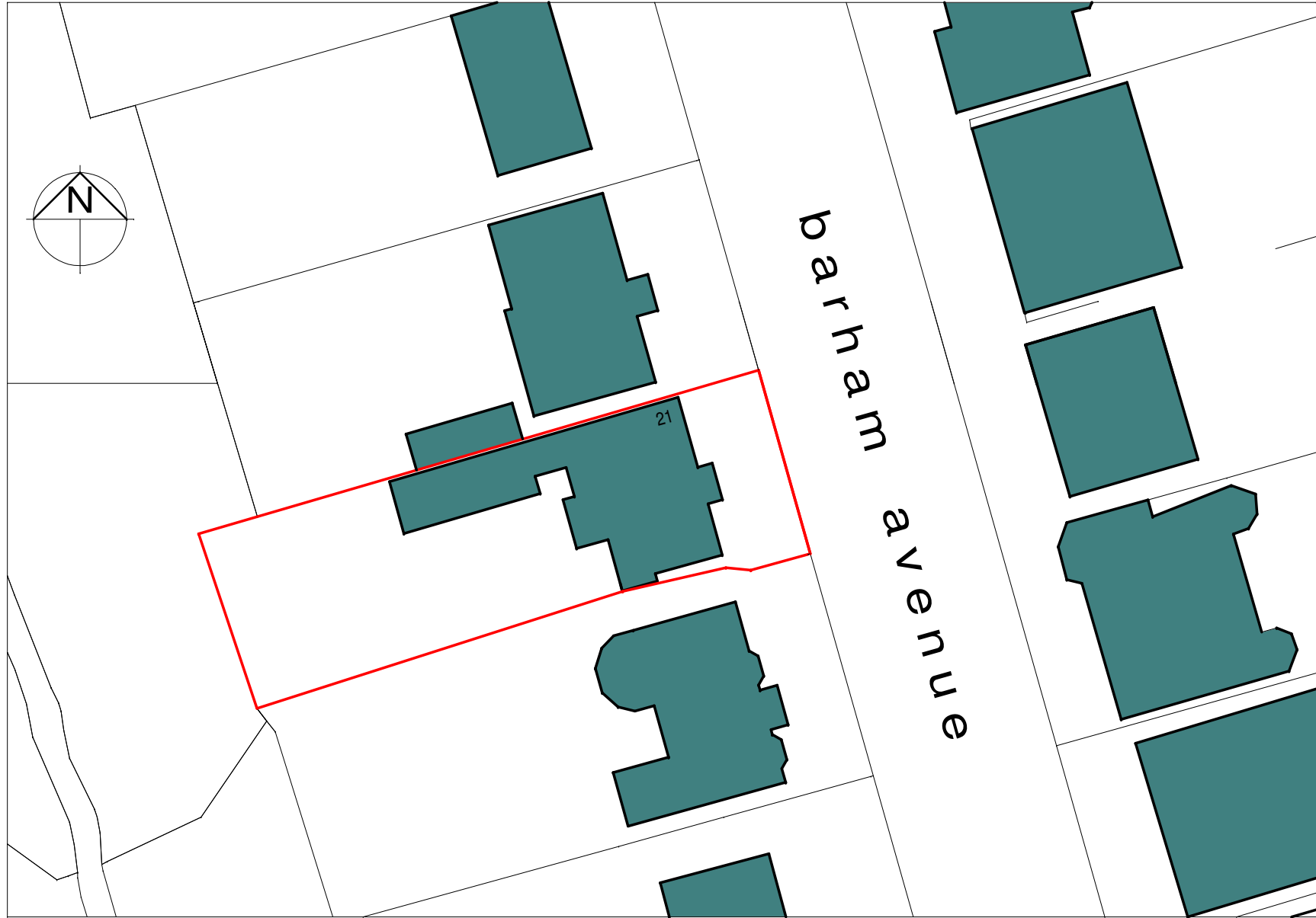
block plan 1:500