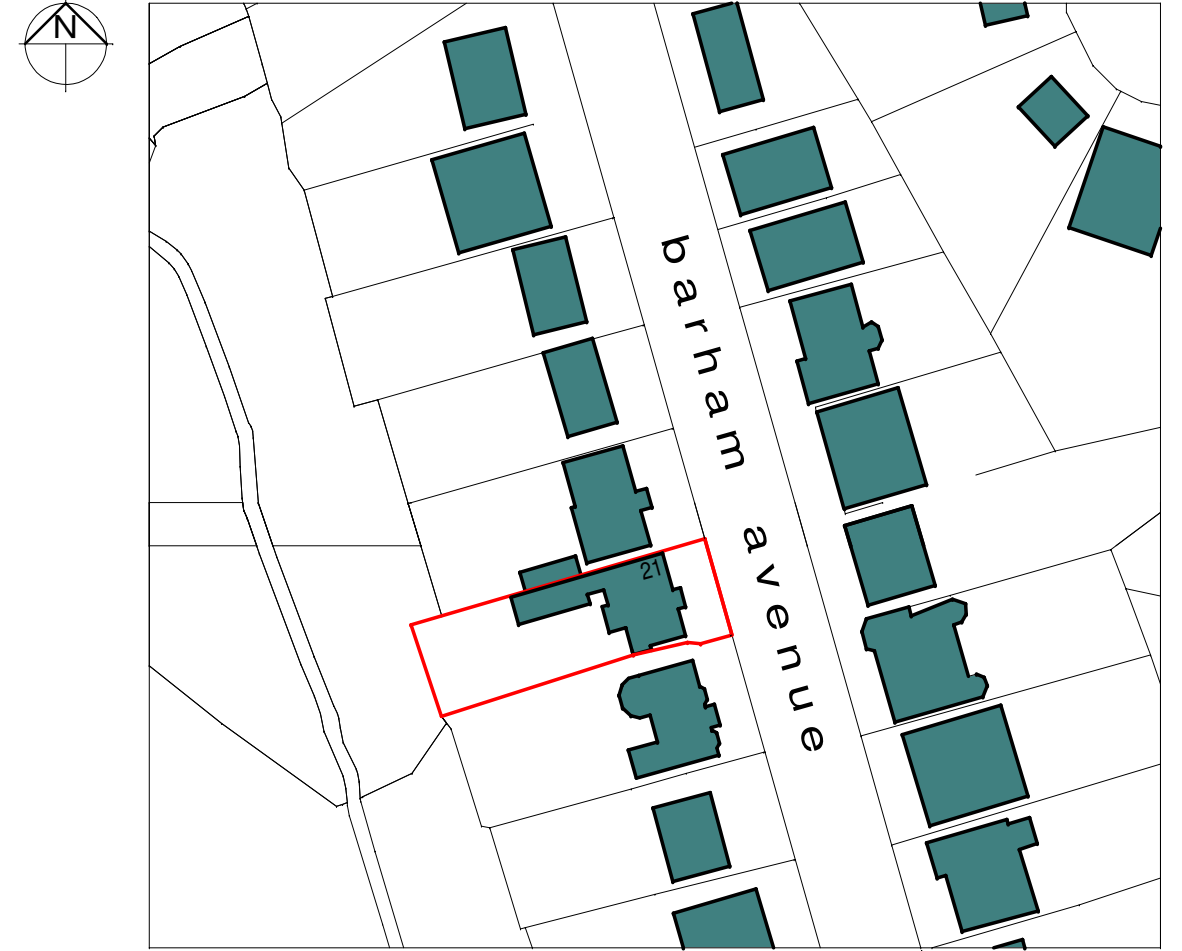
location plan 1:1250