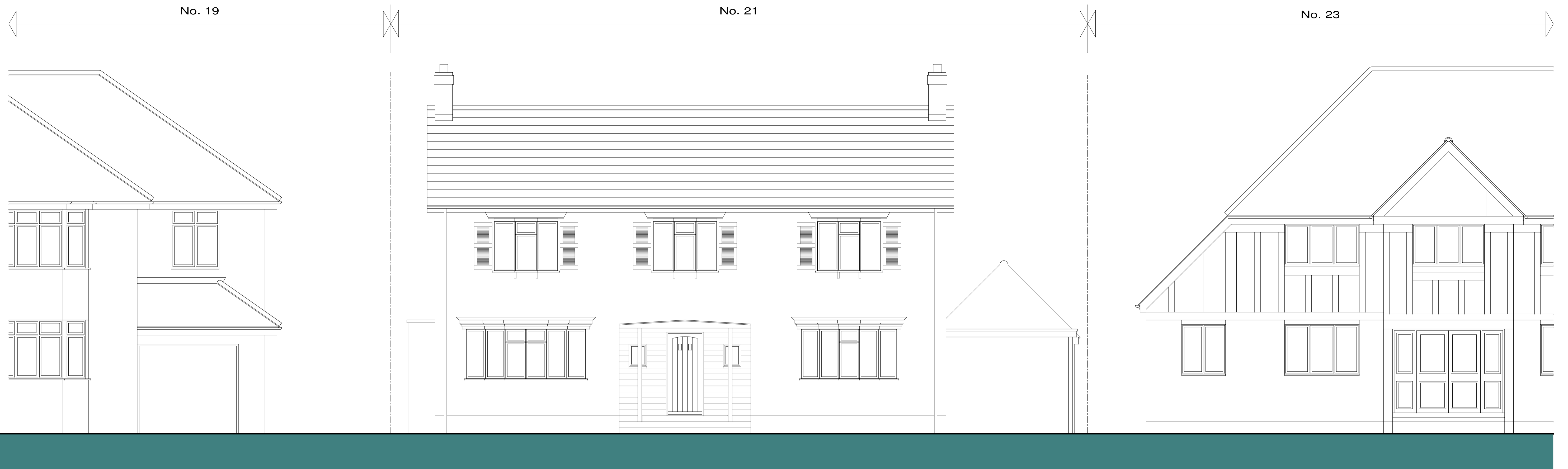
existing front elevation