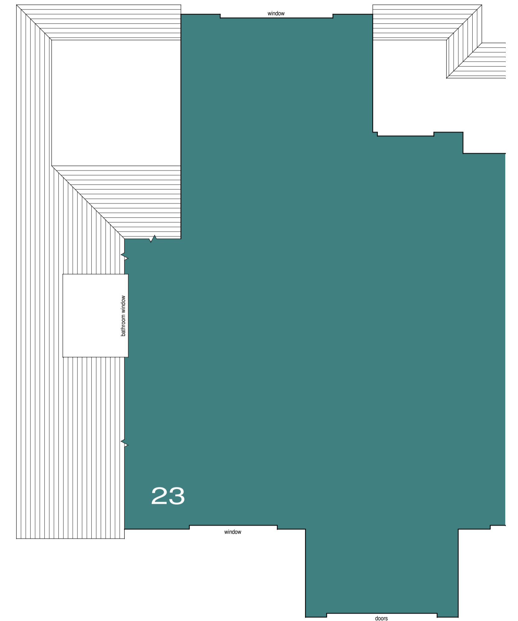
existing first floor plan