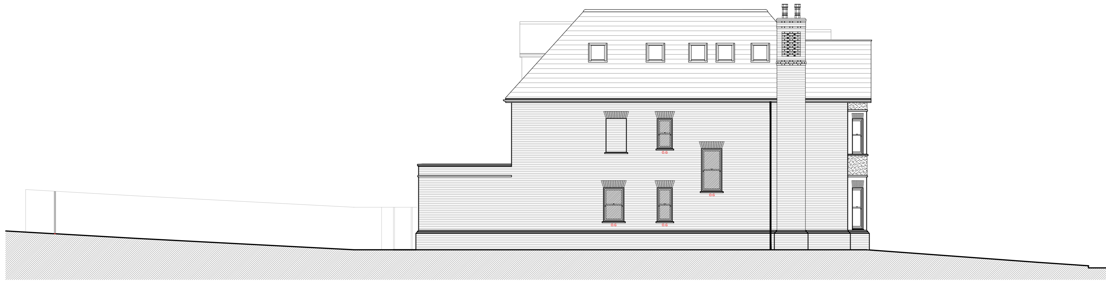
PLOT 1 & 3

© This drawing is copyright and is not to be reproduced or disclosed to third parties without the permission of the author. Do not scale from this drawing, other than for Local Authority Planning purposes. This drawing is to be read in conjunction with all relevant consultants, specialist manufacturers drawings and specifications. Any discrepancies in dimensions or details on or between these drawings should be drawn to our attention. All dimensions are in millimetres unless noted otherwise. Any surveyed information incorporated within this drawing cannot be guaranteed as accurate unless confirmed by field dimension.