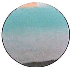
CROSS SECTION OF THE GLASS FIBRE MEDIA USED IN TYPE 90 PANEL FILTERS