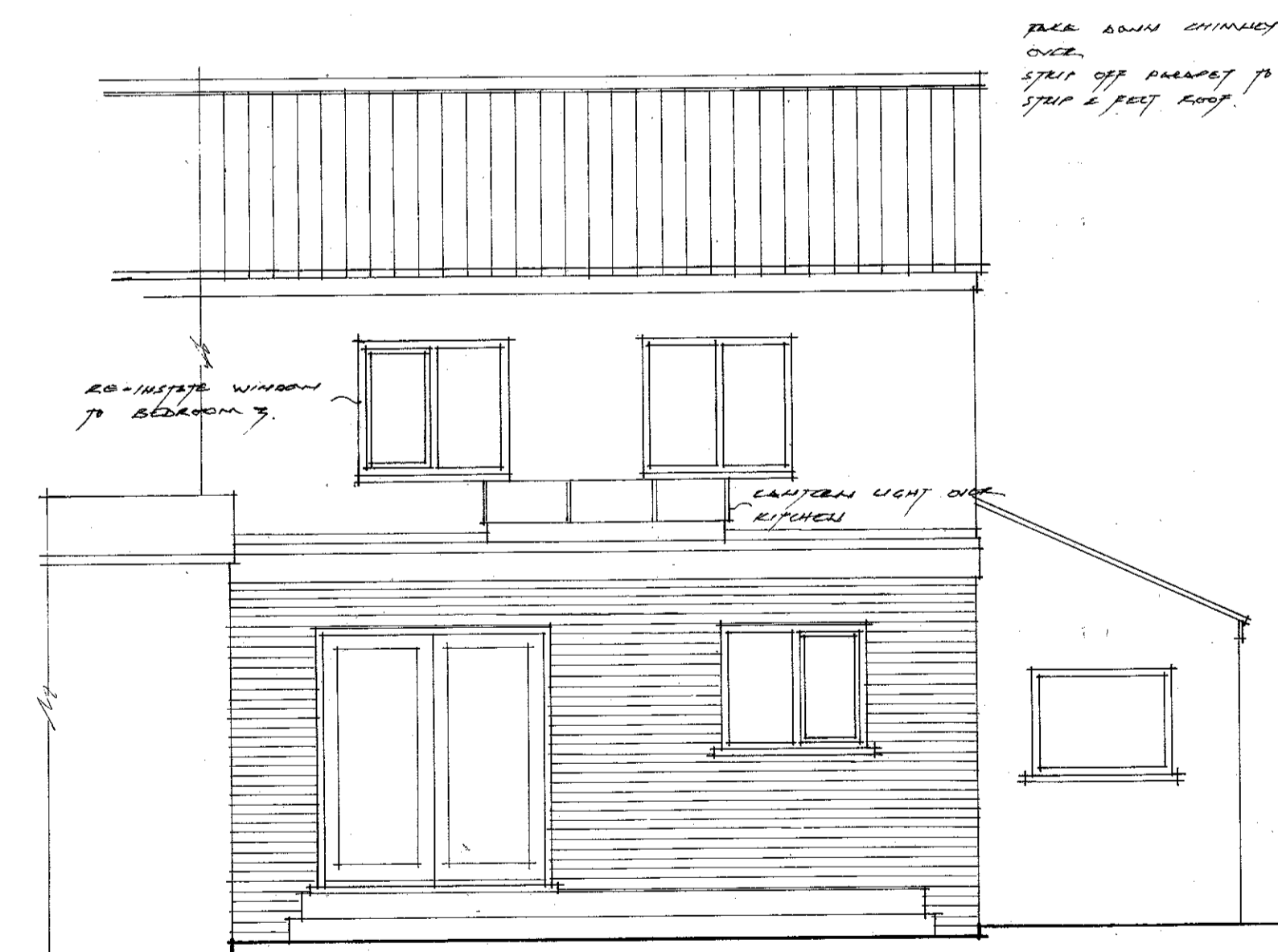
BACK ELEVATION AS PROPOSED.