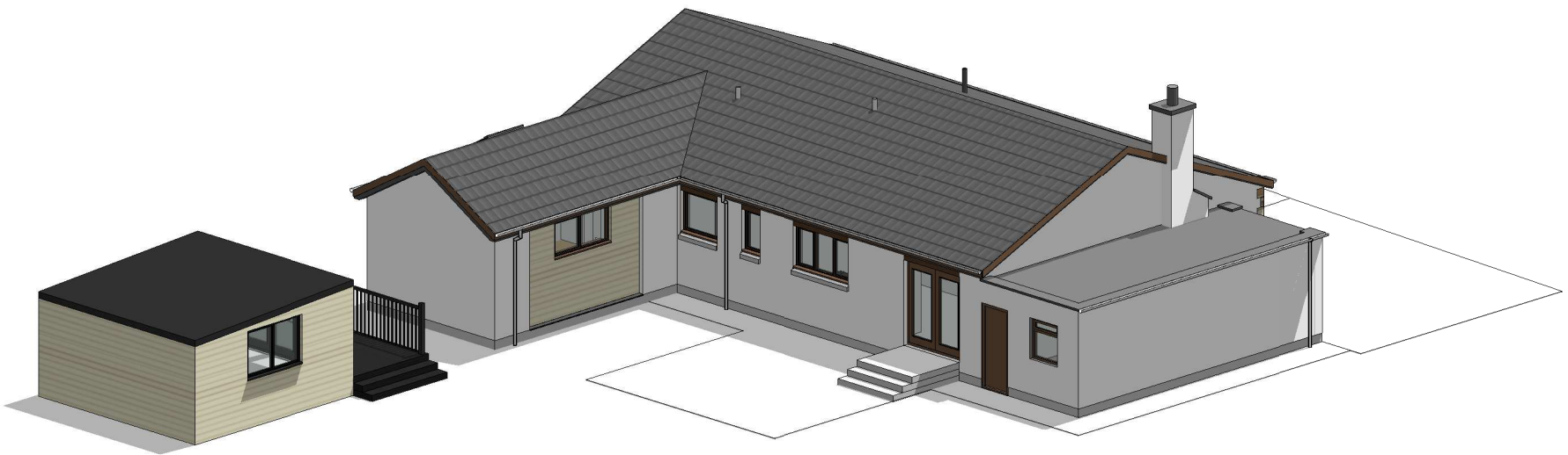
View 2 - proposed