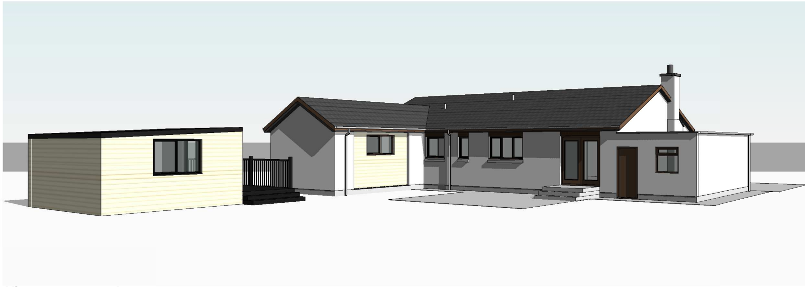
View 1 - proposed