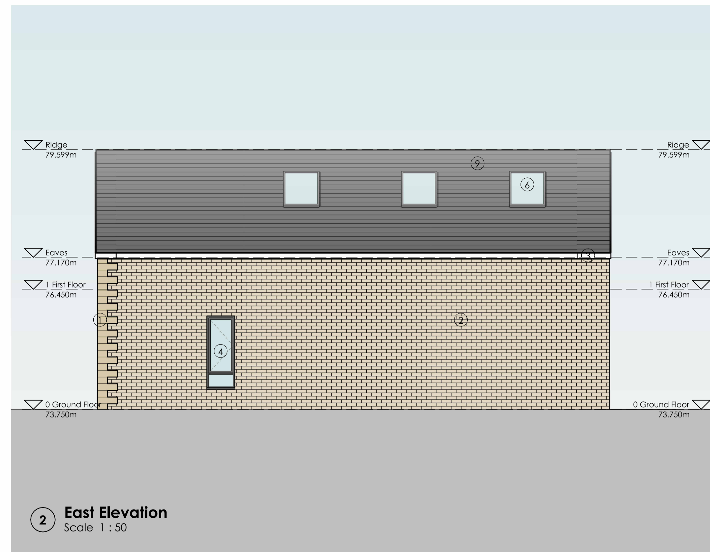
2 East Elevation Scale 1 : 50