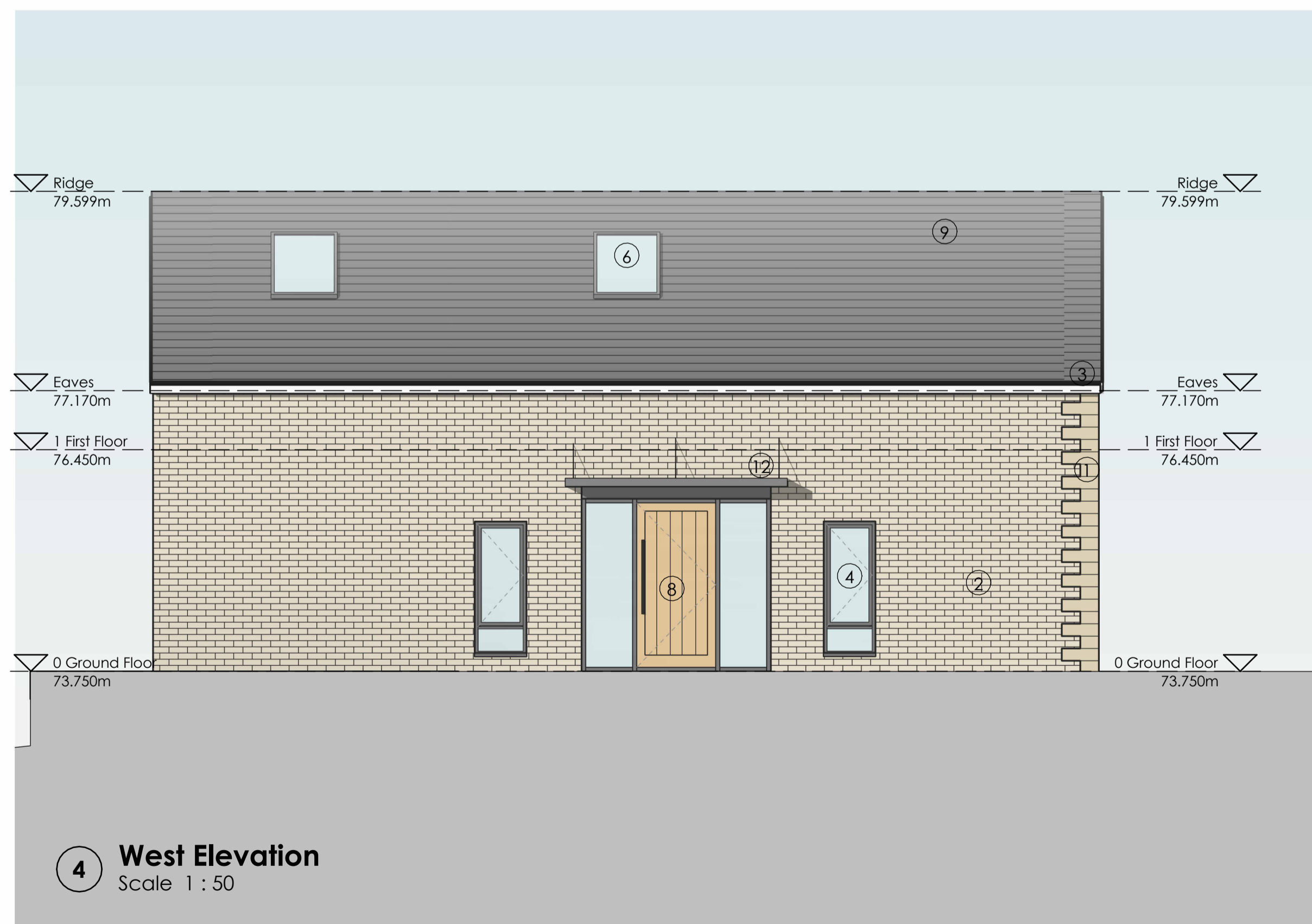
4 West Elevation Scale 1 : 50