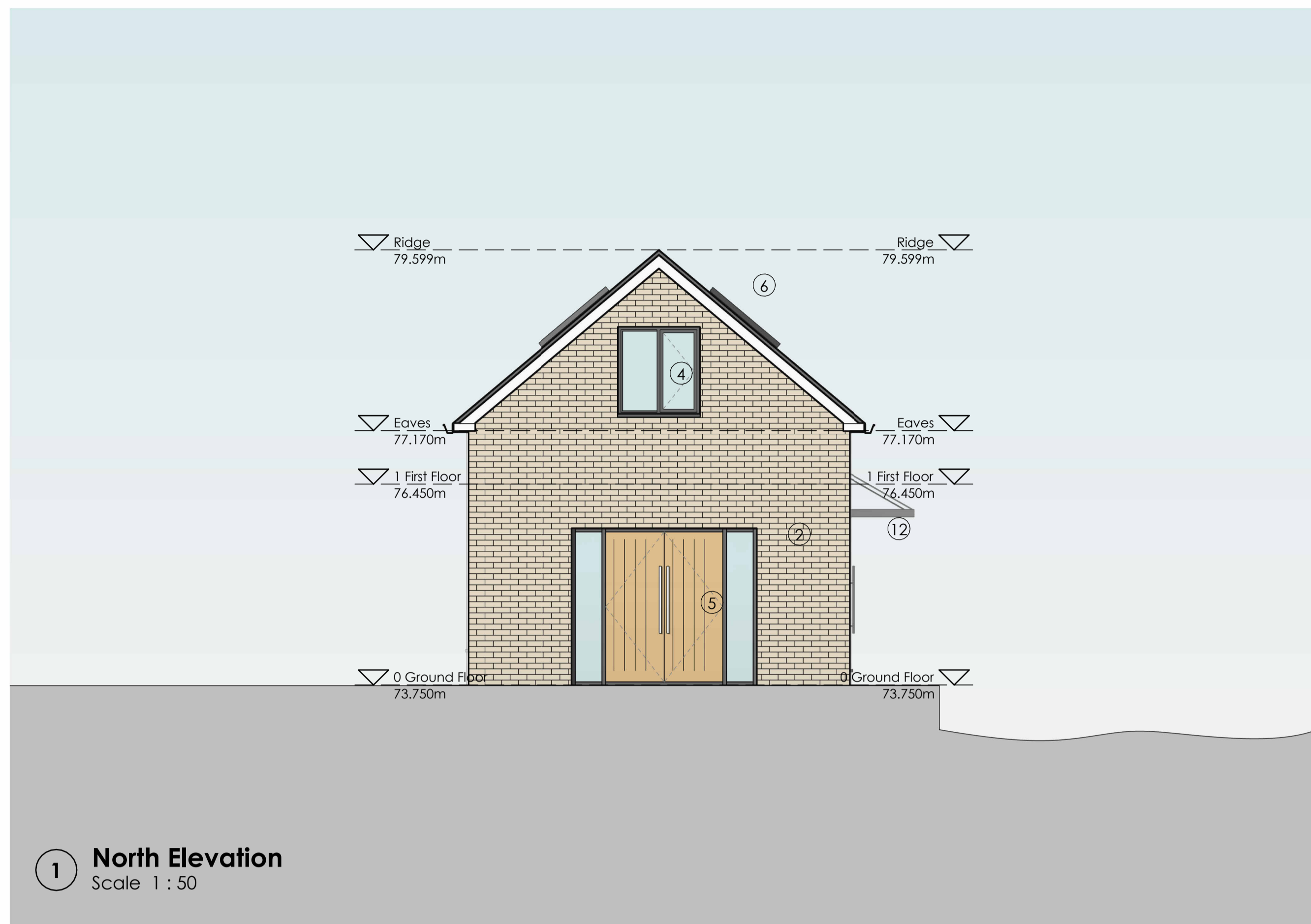
1 North Elevation Scale 1 : 50