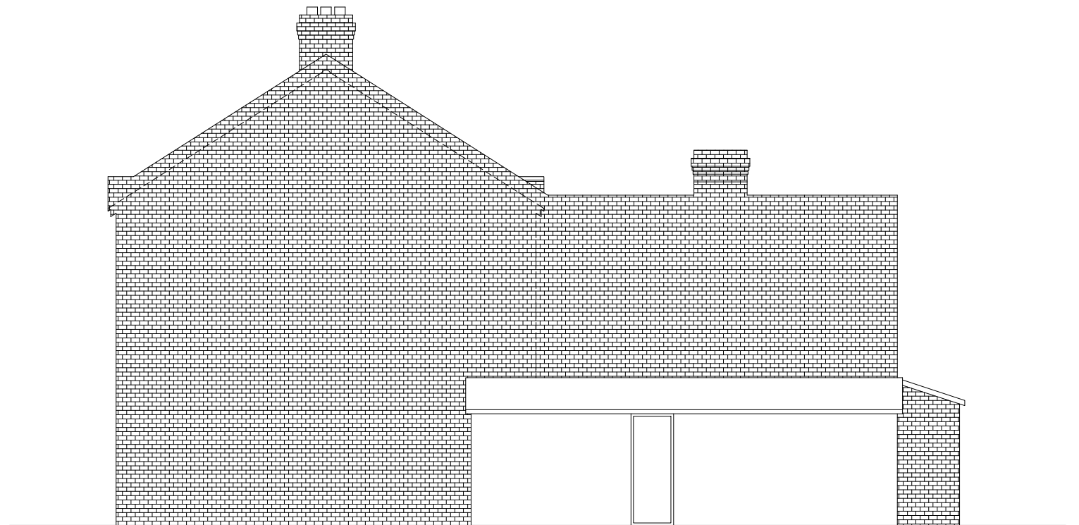
SIDE ELEVATION (1:100 @ A3)