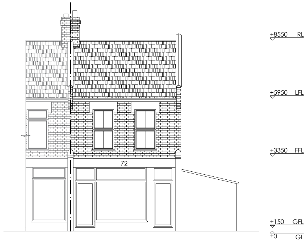
FRONT ELEVATION (1:100 @ A3)