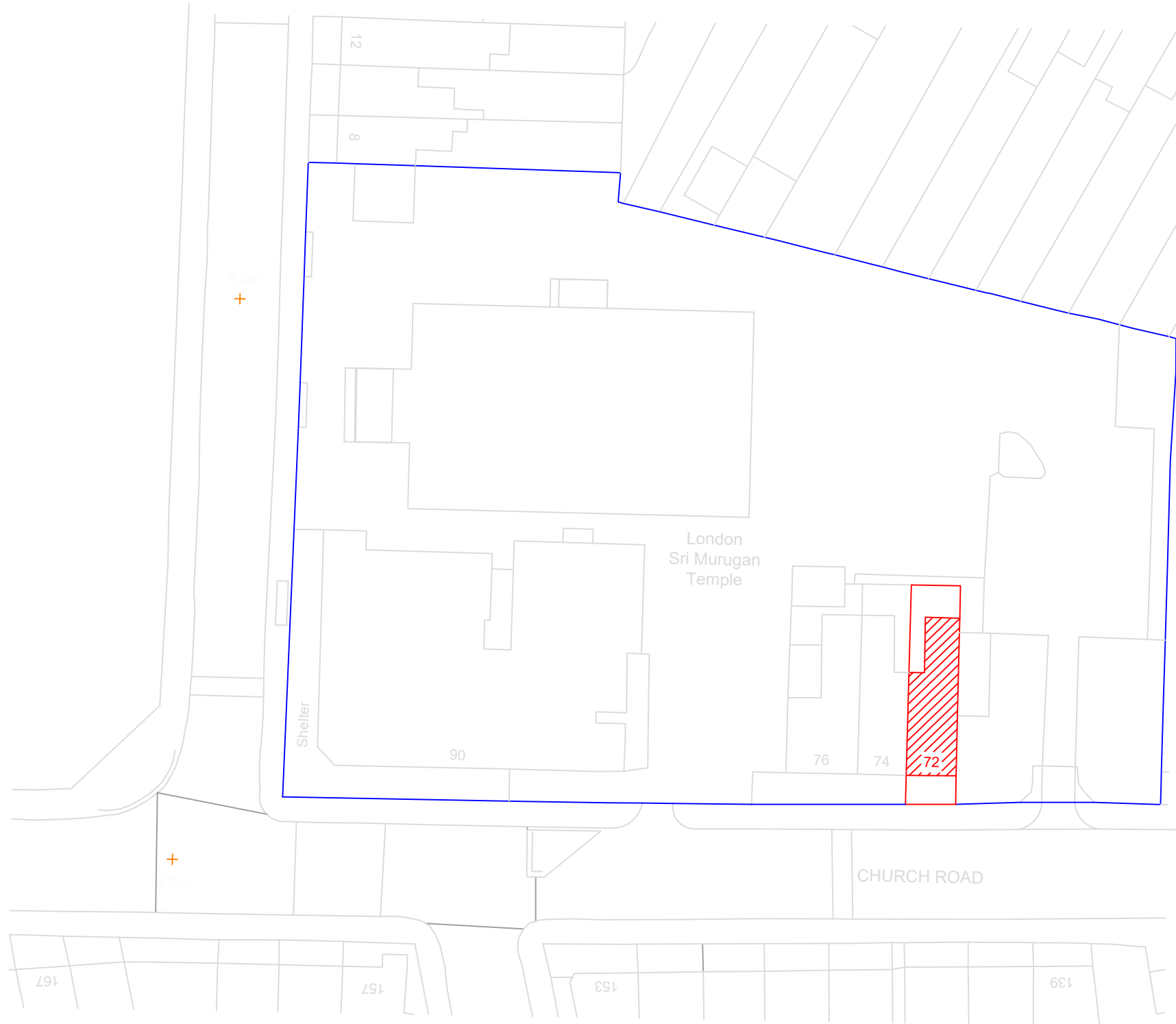
SITE PLAN (1:500 @ A3)