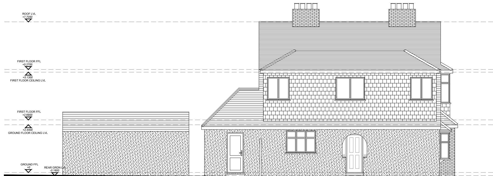
SIDE ELEVATION 01