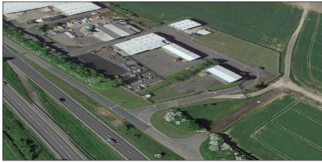
Existing South Elevation (Facing North)