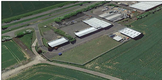
Aerial View of Site