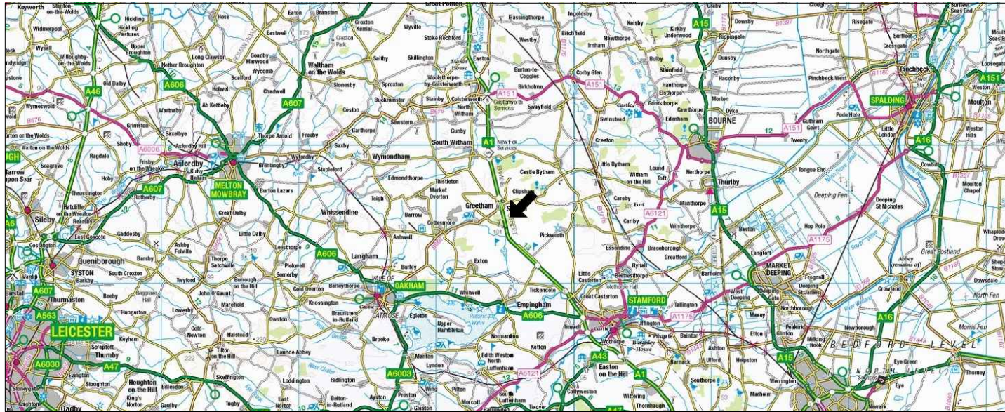
Location Plan