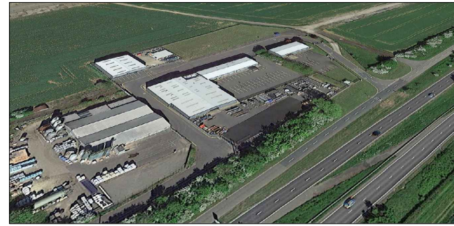
Existing West Elevation (Facing East)