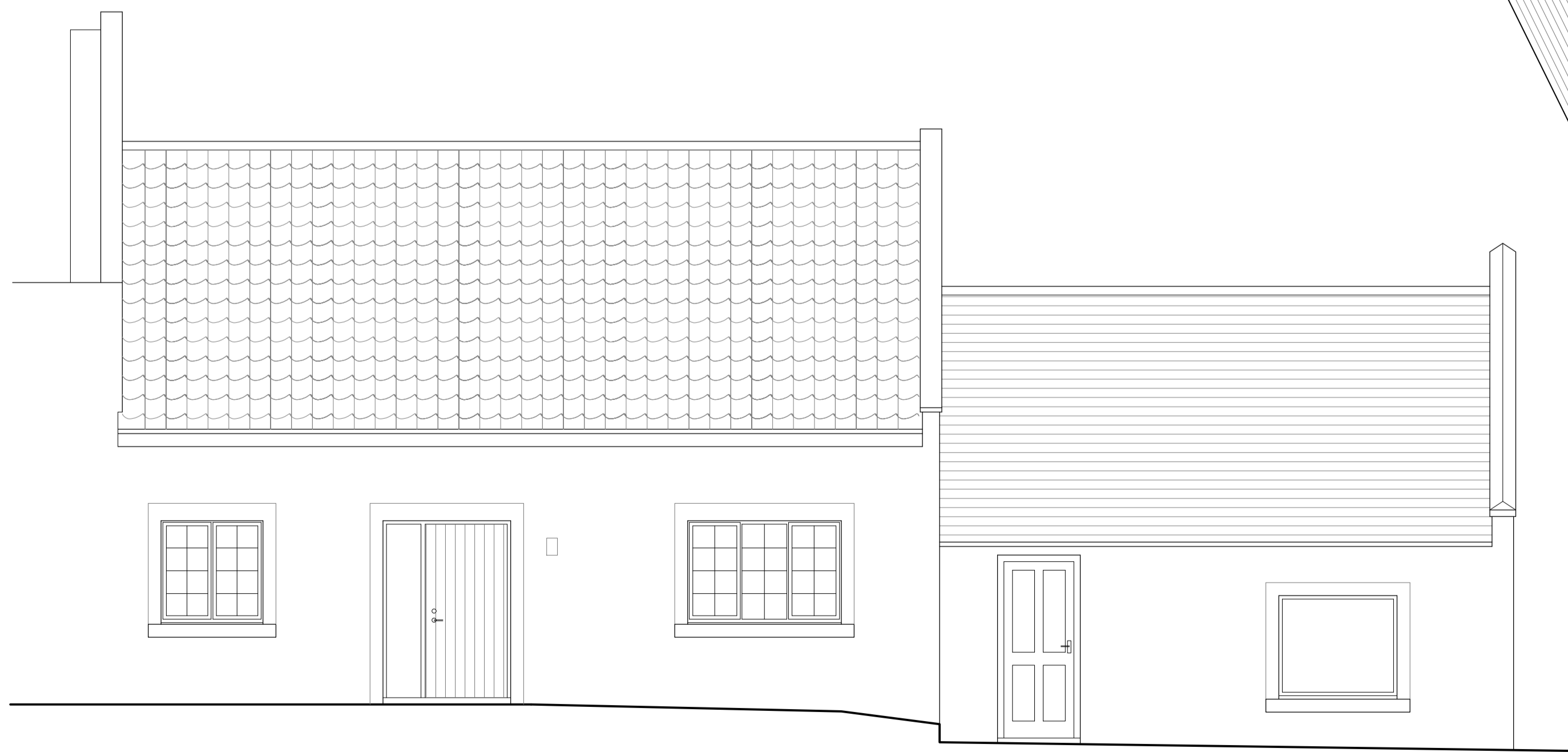
West Elevation (Cottage)