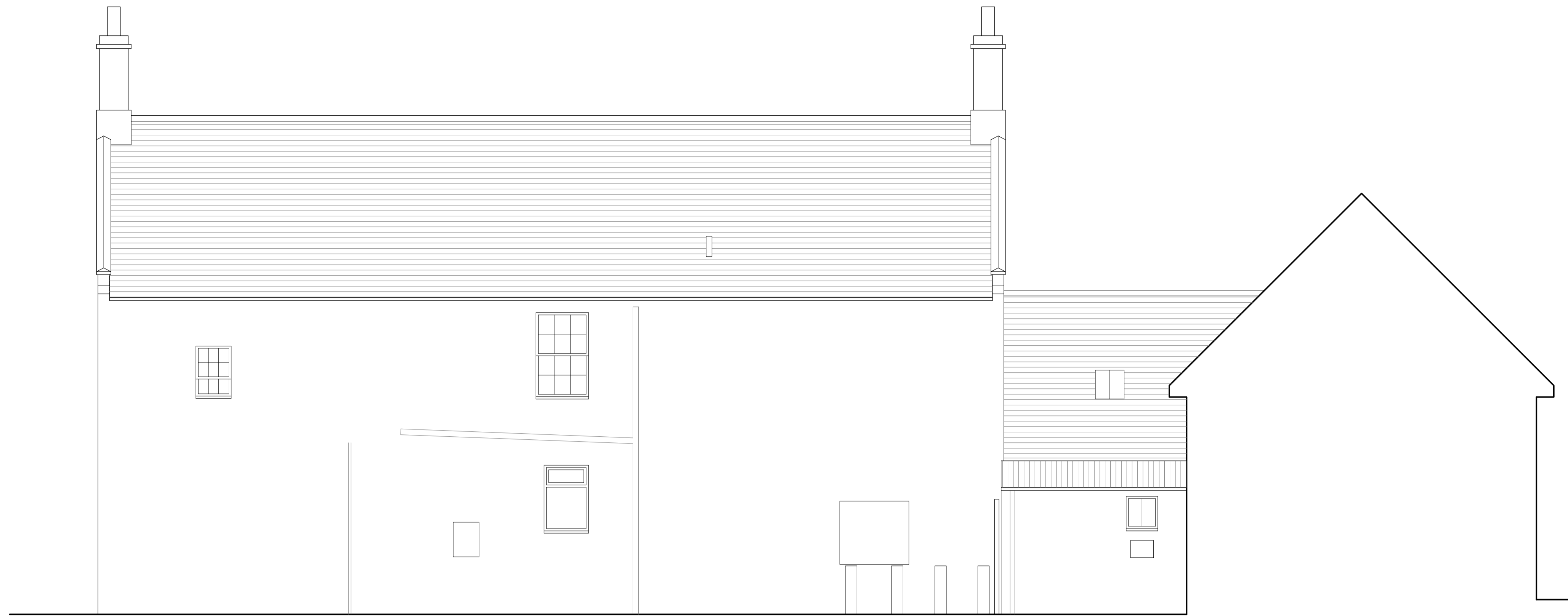
North Elevation (Main House)