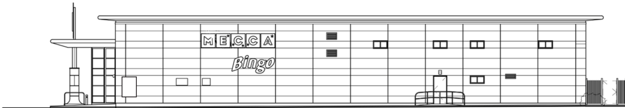
SIDE (East) ELEVATION