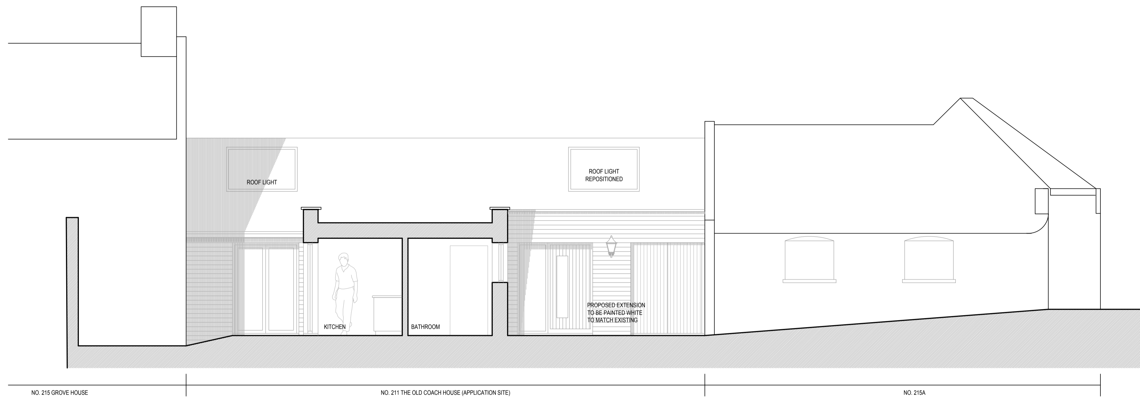
PROPOSED NORTH EAST ELEVATION Scale 1:50