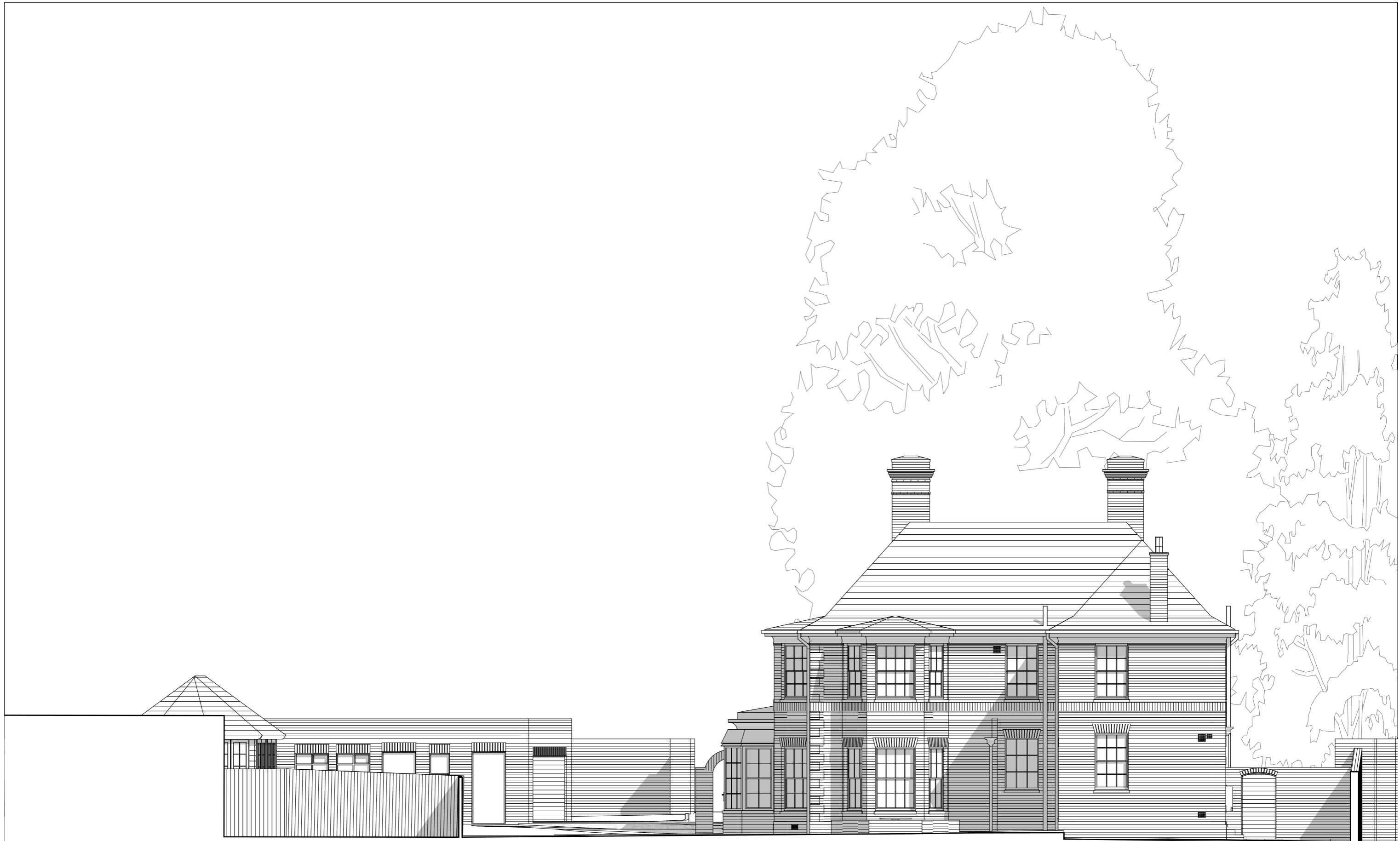
01 EAST ELEVATION SCALE 1:100