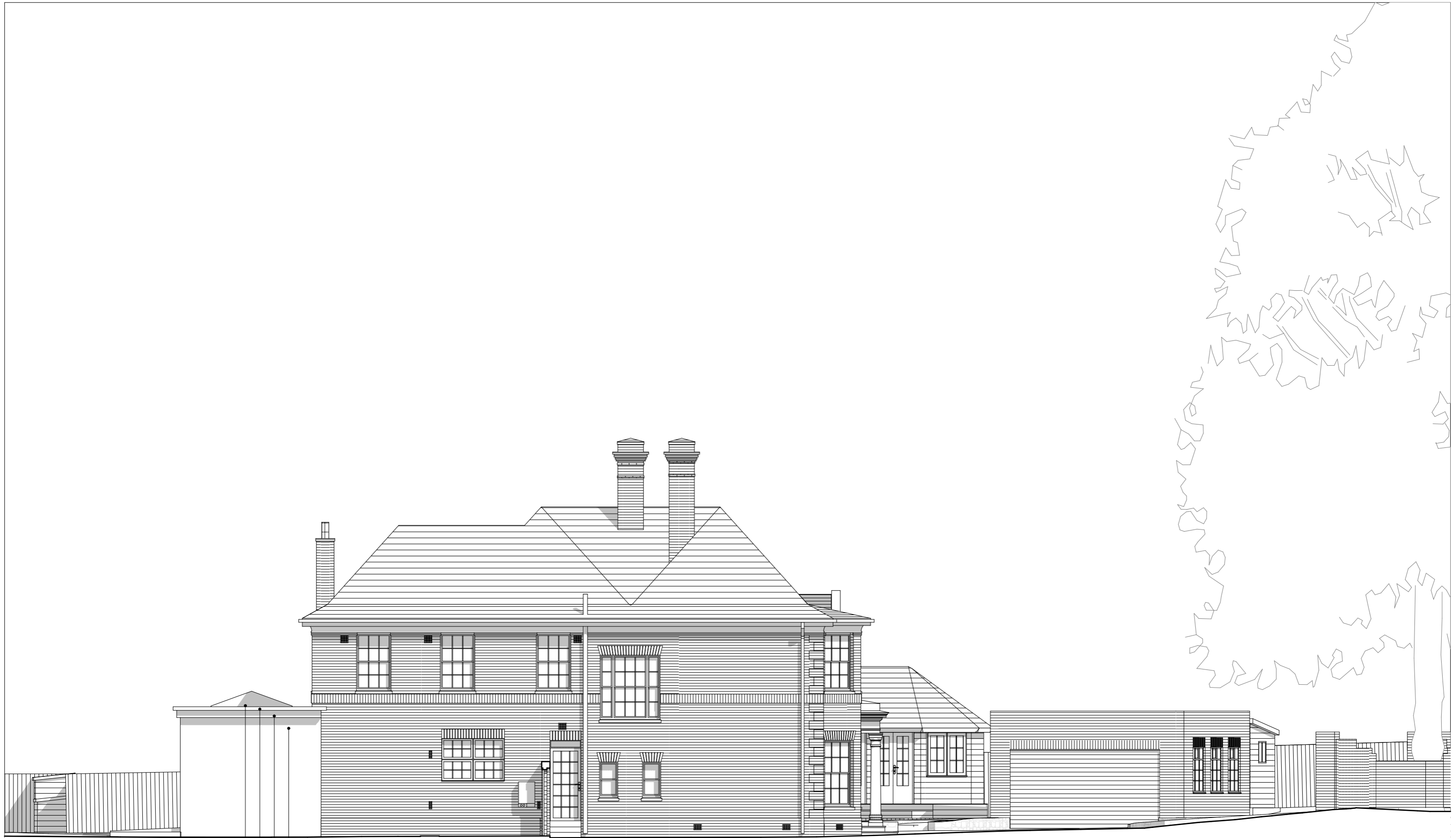
01 NORTH ELEVATION SCALE 1:100