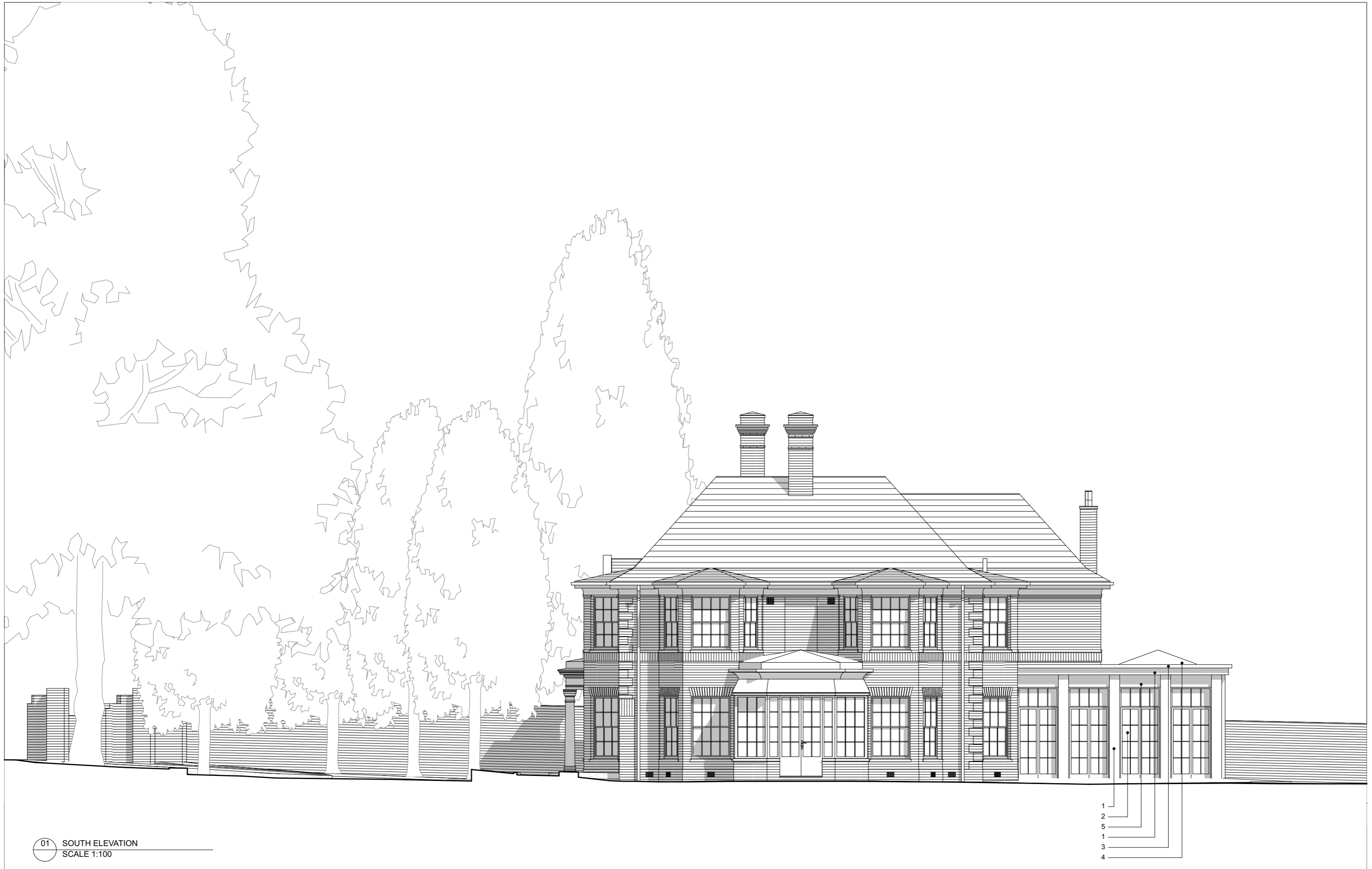
01 SOUTH ELEVATION SCALE 1:100