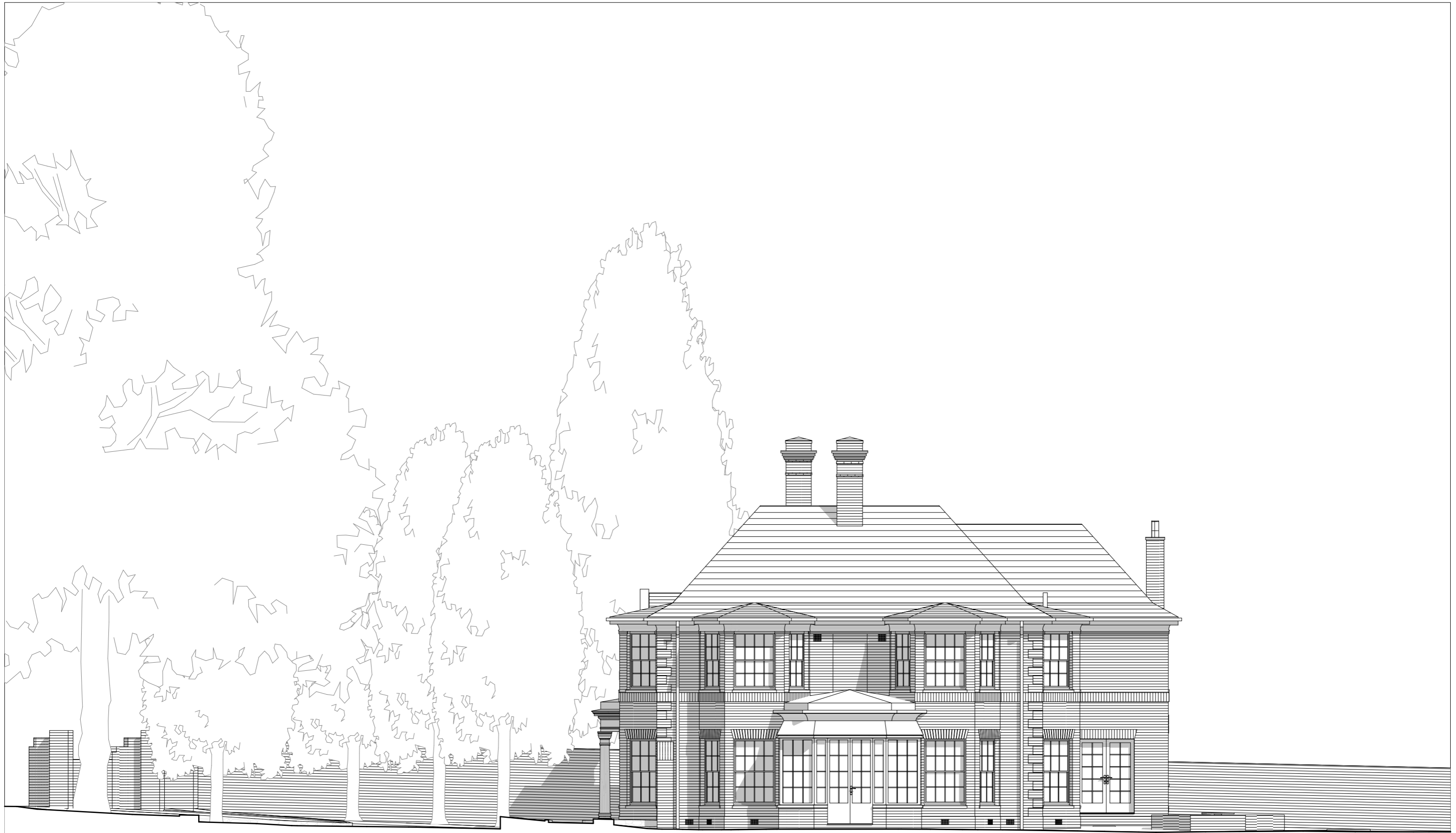
01 SOUTH ELEVATION SCALE 1:100