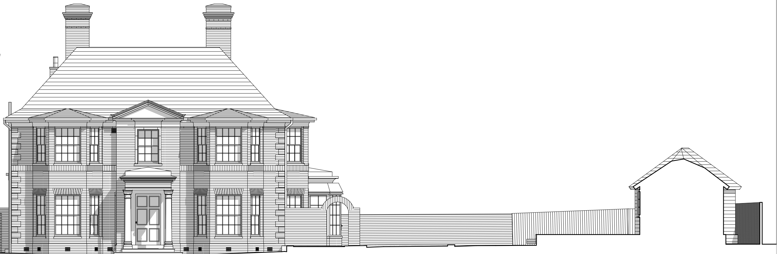
01 WEST ELEVATION SCALE 1:100