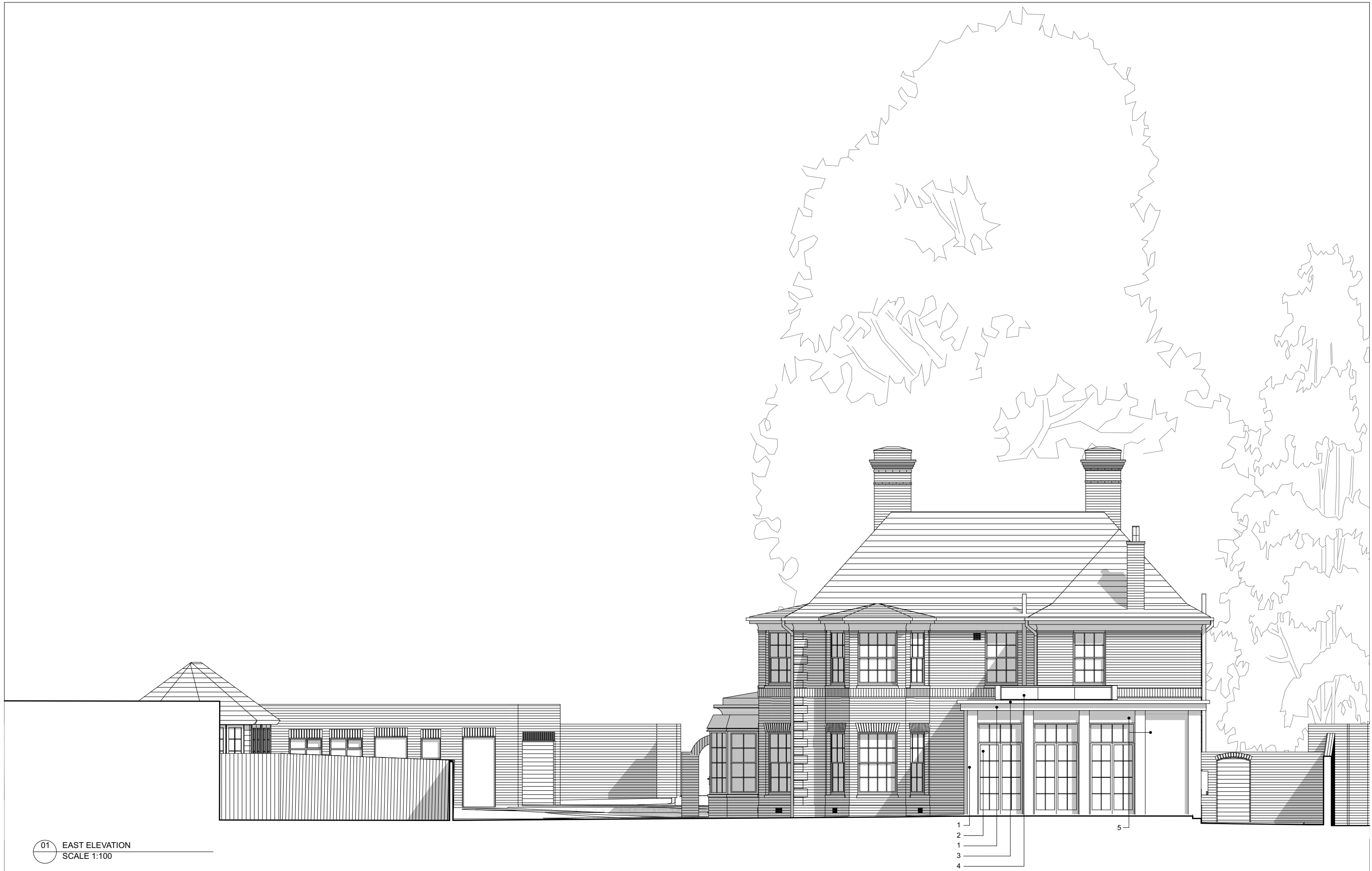
01 EAST ELEVATION SCALE 1:100