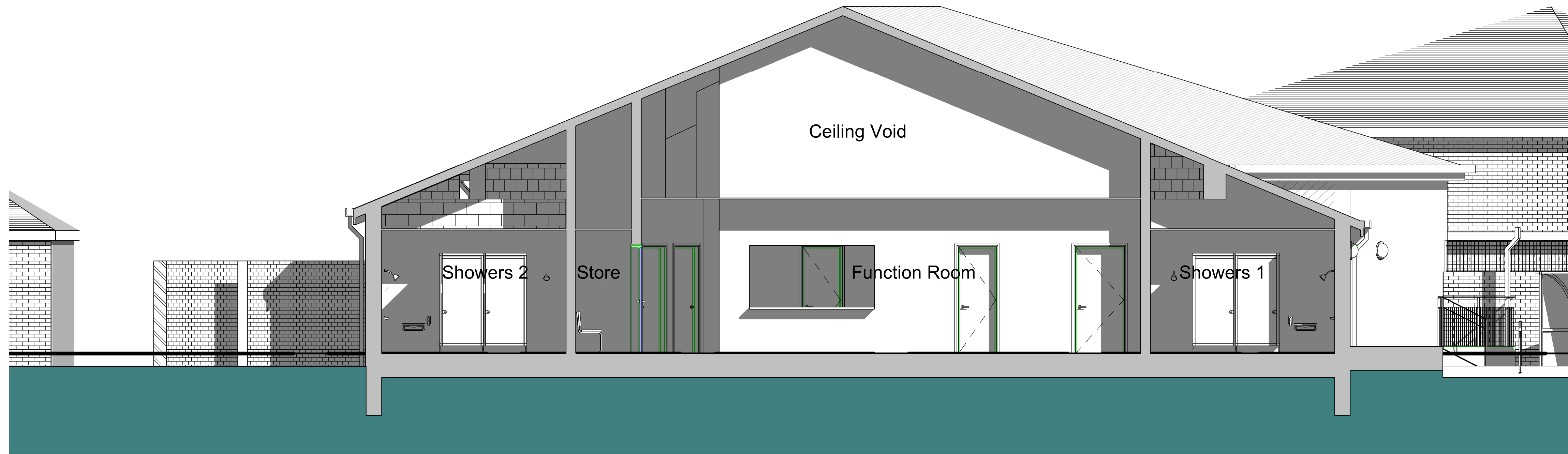
1 Section A 1 : 50