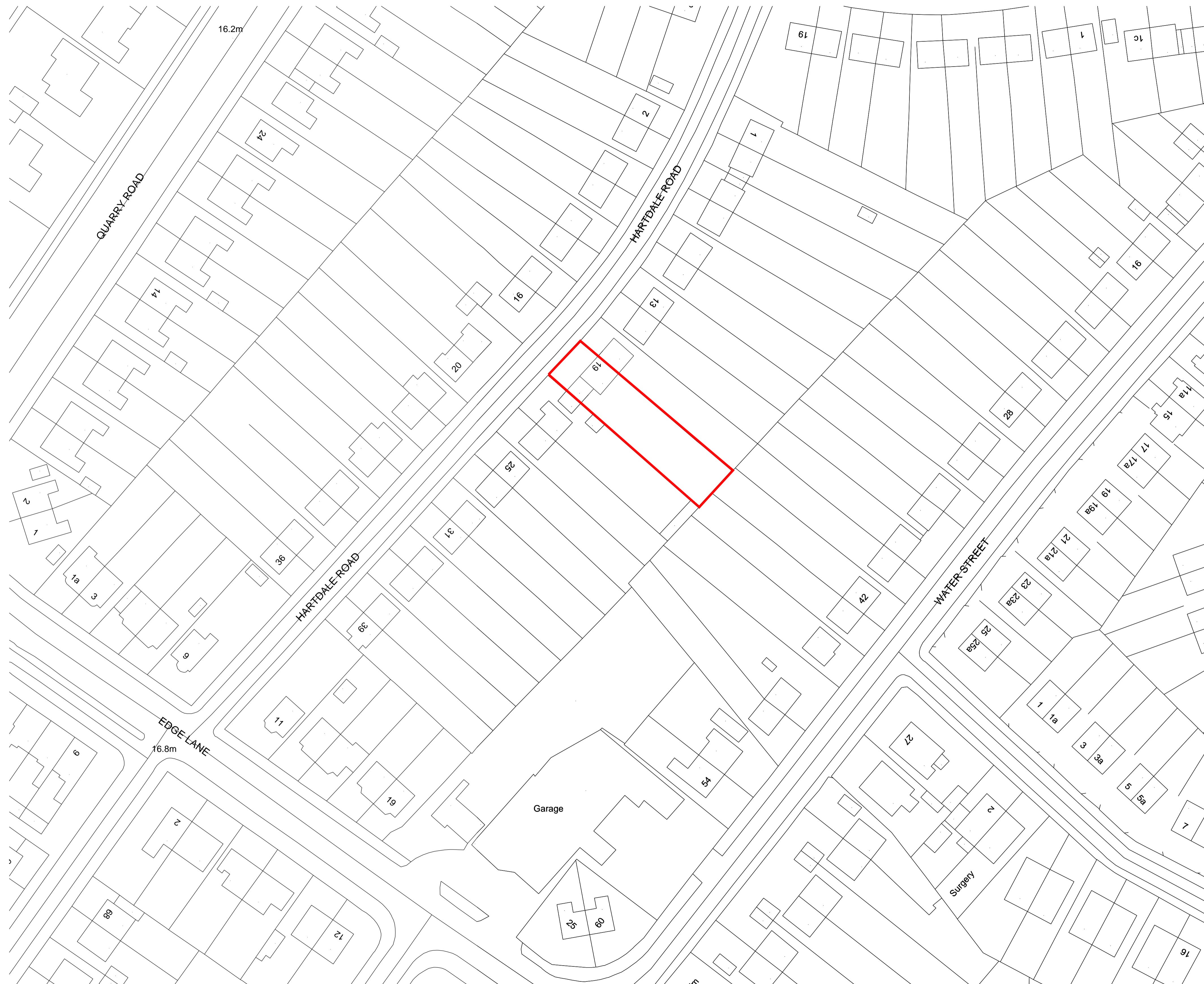
EXISTING SITE PLAN | 6 FD 0H