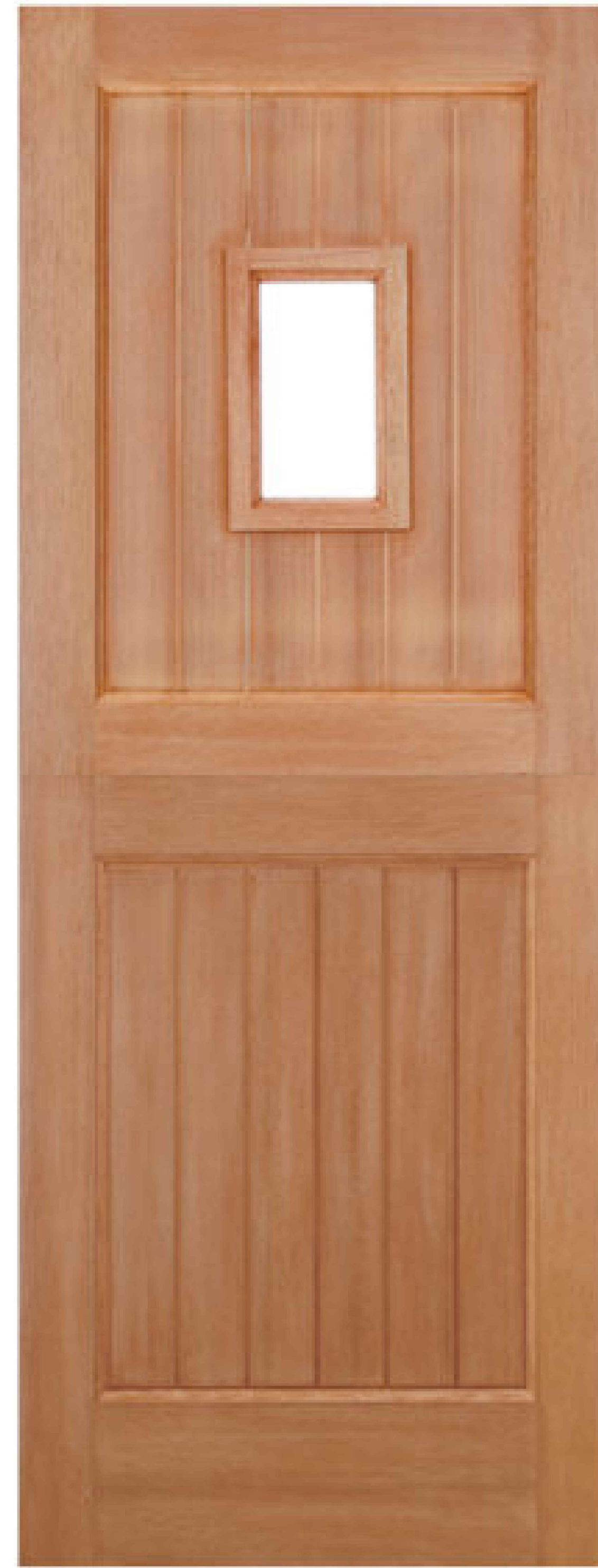
IMAGE OF DOOR TO BE PAINTED GREEN TO MATCH WINDOWS

ED0.05 Wooden door - Open out Level access stone threshold Timber Head Hold open required Glass Opaque TBC