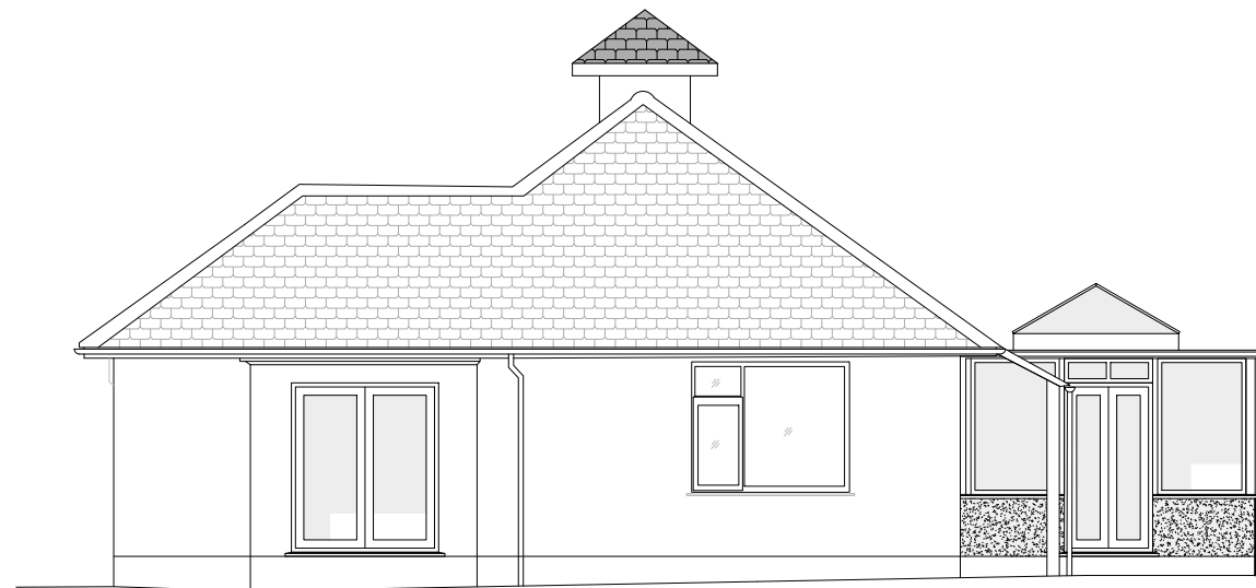
03 RH SIDE (SOUTH-FACING) ELEVATION