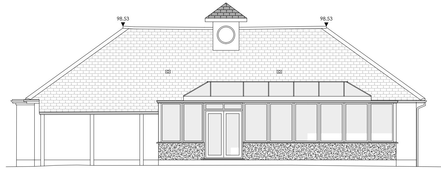
04 REAR (EAST-FACING) ELEVATION