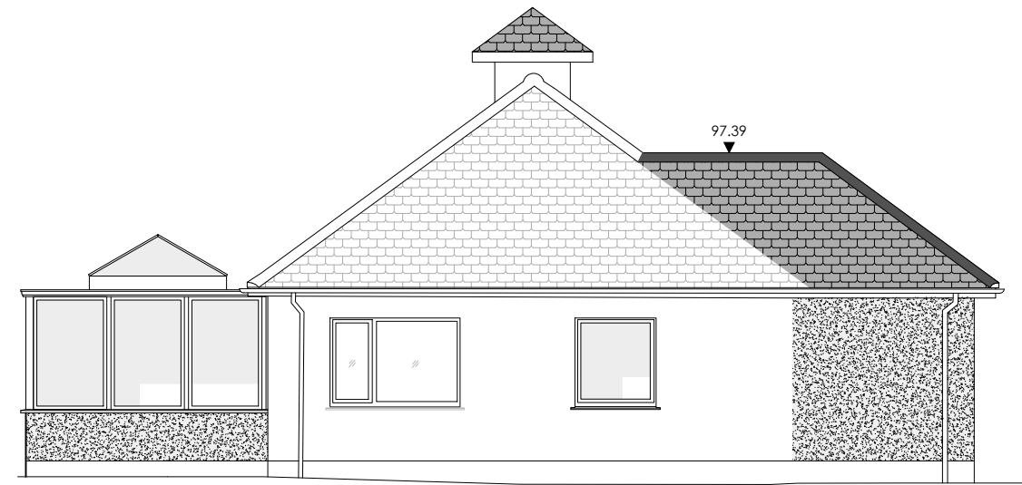
02 LH SIDE (NORTH-FACING) ELEVATION

MATERIALS Grey fibre cement roof coverings. Black half-round ridge tiles Smooth-render walls painted white White uPVC doors White uPVC sash-style windows White uPVC fascias and soffits White uPVC rainwater goods