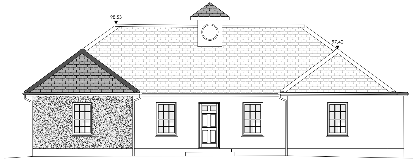
01 FRONT (WEST-FACING) ELEVATION

MATERIALS Grey fibre cement roof coverings. Black half-round ridge tiles Smooth-render walls painted white White uPVC doors White uPVC sash-style windows White uPVC fascias and soffits White uPVC rainwater goods