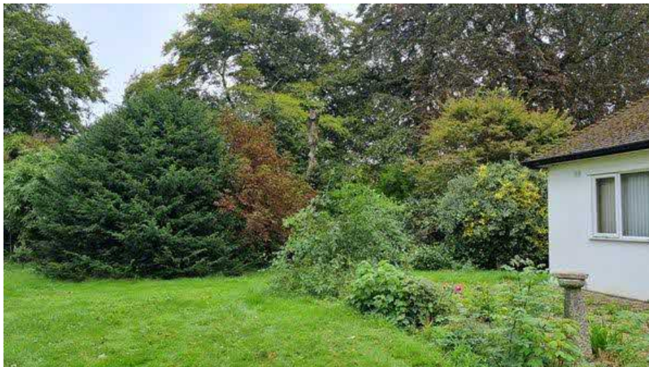
Yew tree located on left, existing house on right

I visited the site on 20 th September 2023 to survey any trees that may be affected by the development proposals in accordance with BS5837:2012. To the north of the existing house there is a Yew tree. the main trunk located 11m from the corner of the house. The tree is 5m in height with twin stems both measuring 130mm giving a root protection area (RPA) radius of 2.2m. The tree has a canopy spread of 3m.