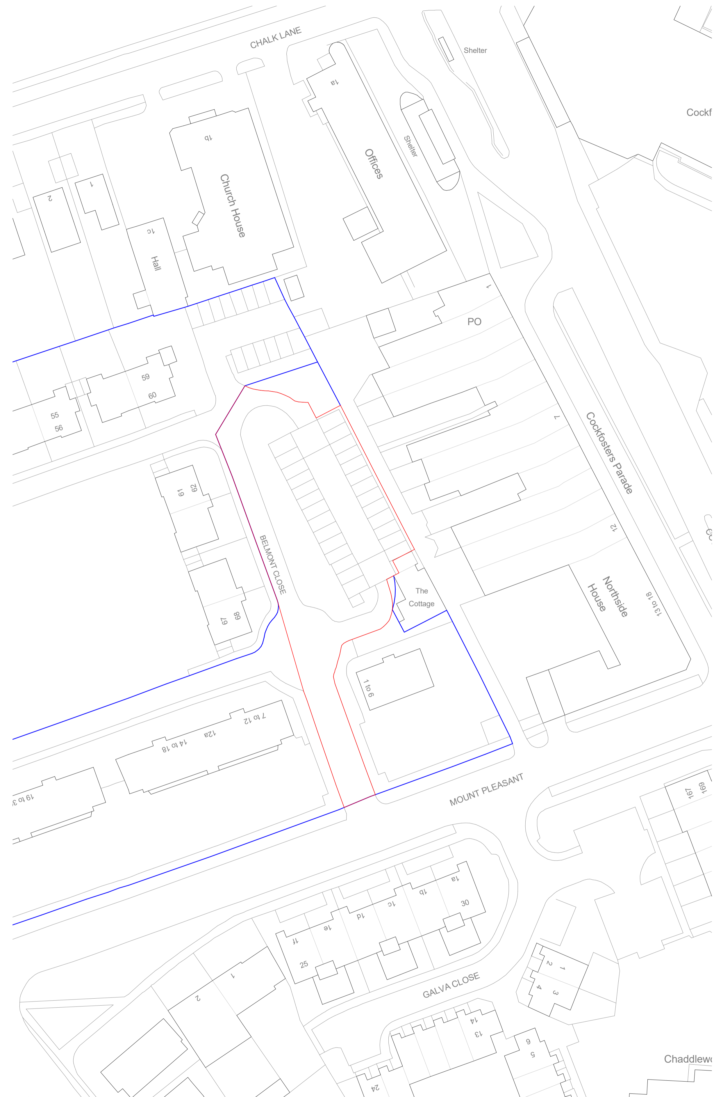
2 | Block Plan 1:500