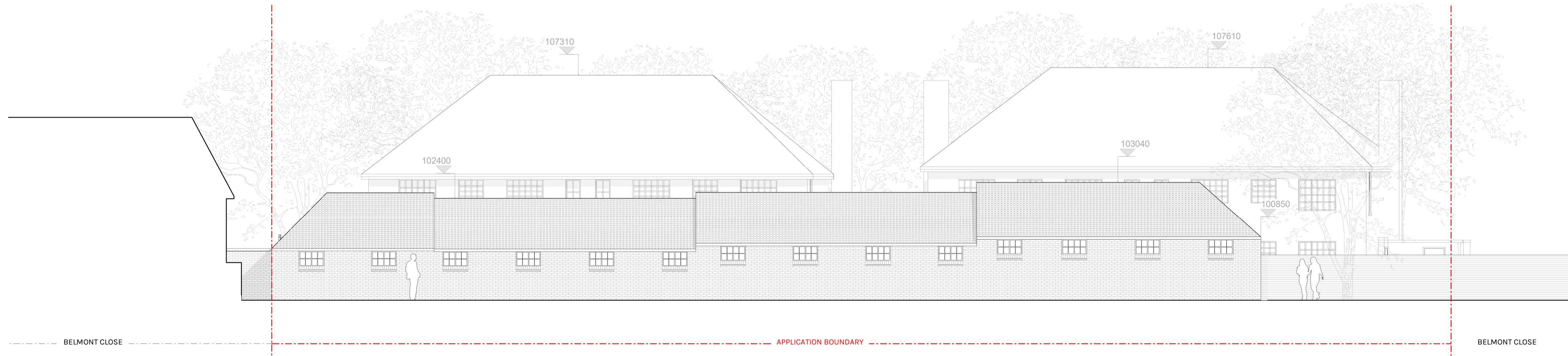
1 Existing East Elevation 1:100

Downen Farmer Architects Ltd is incorporated in England & Wales. Company registration number 10861309.