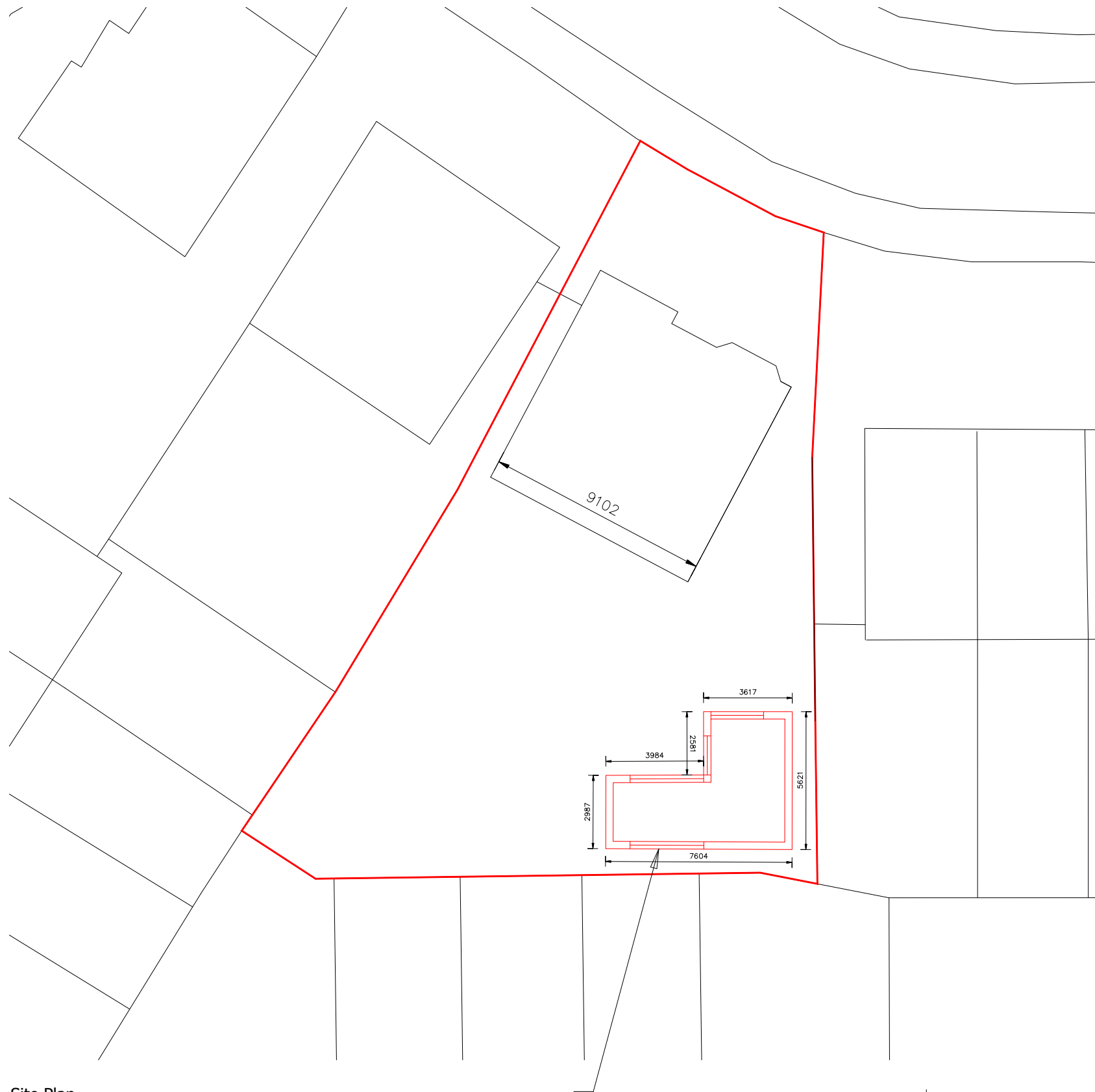
Site Plan Scale 1:200