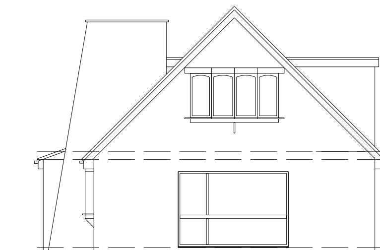
SIDE ELEVATION - SOUTH