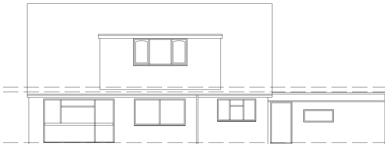
REAR ELEVATION - EAST