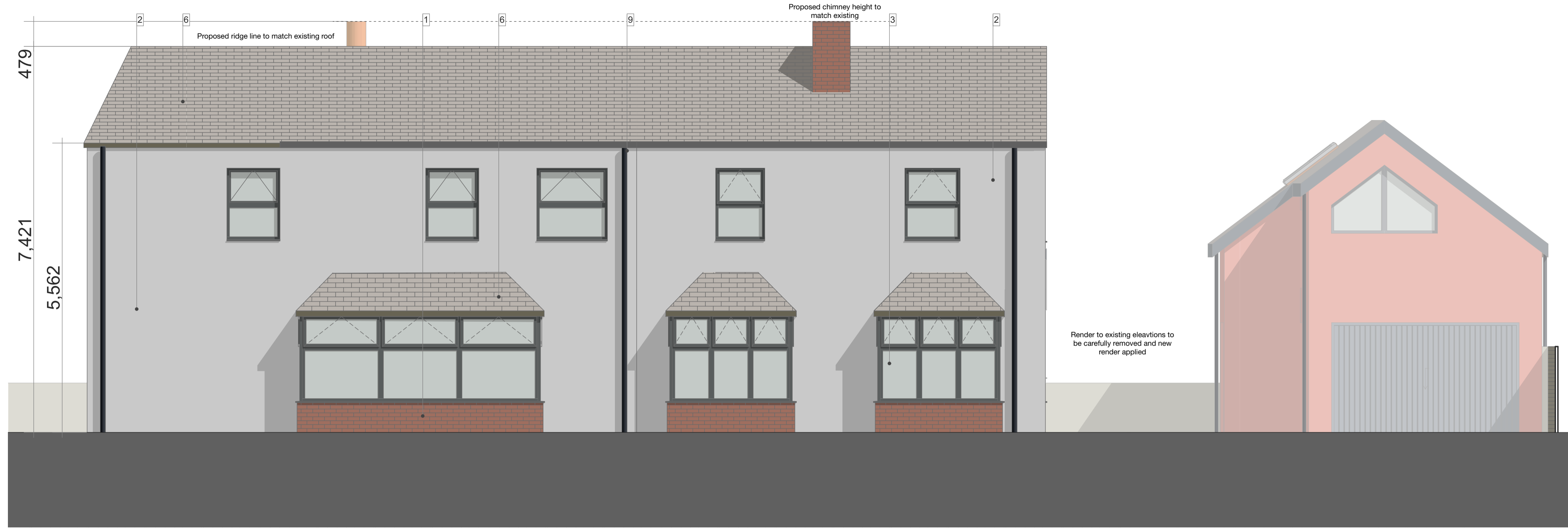
South Elevation 1:50