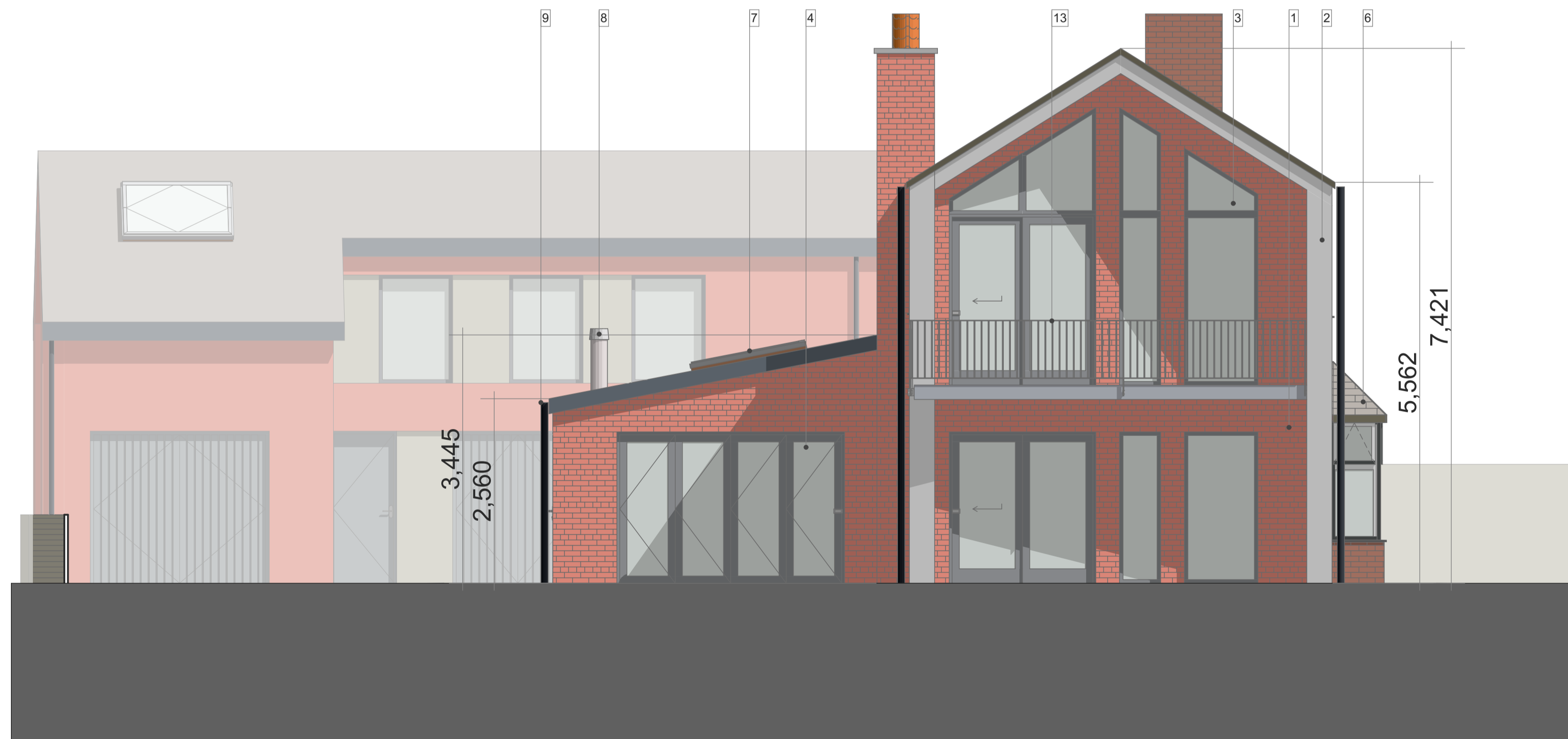
West Elevation 1:50