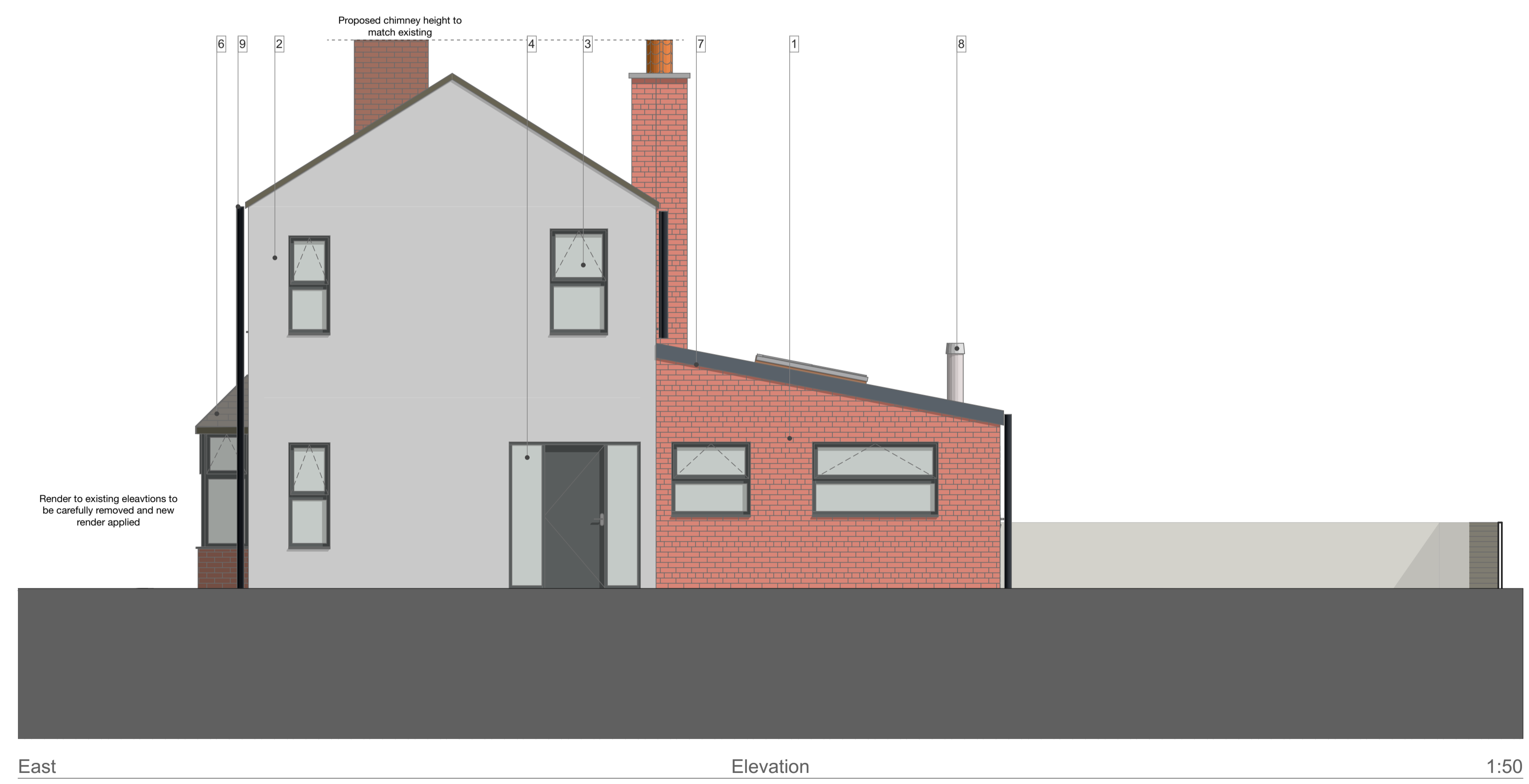
East Elevation 1:50