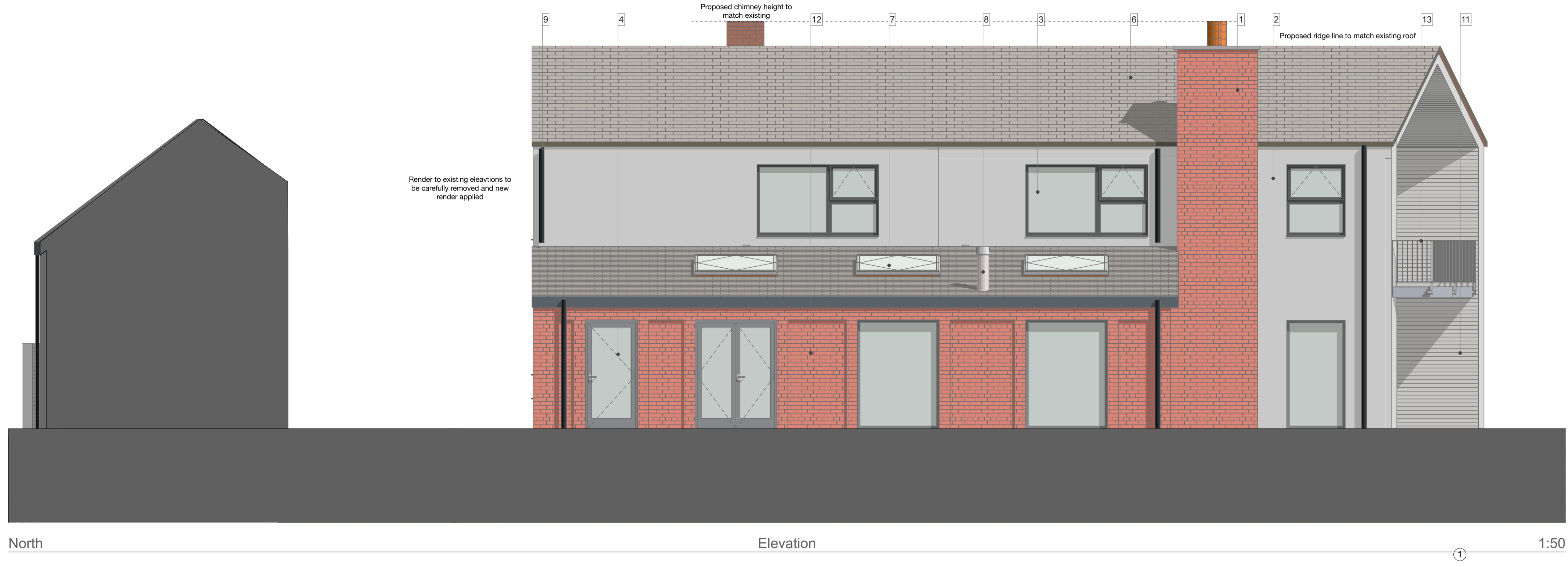
North Elevation 1:50