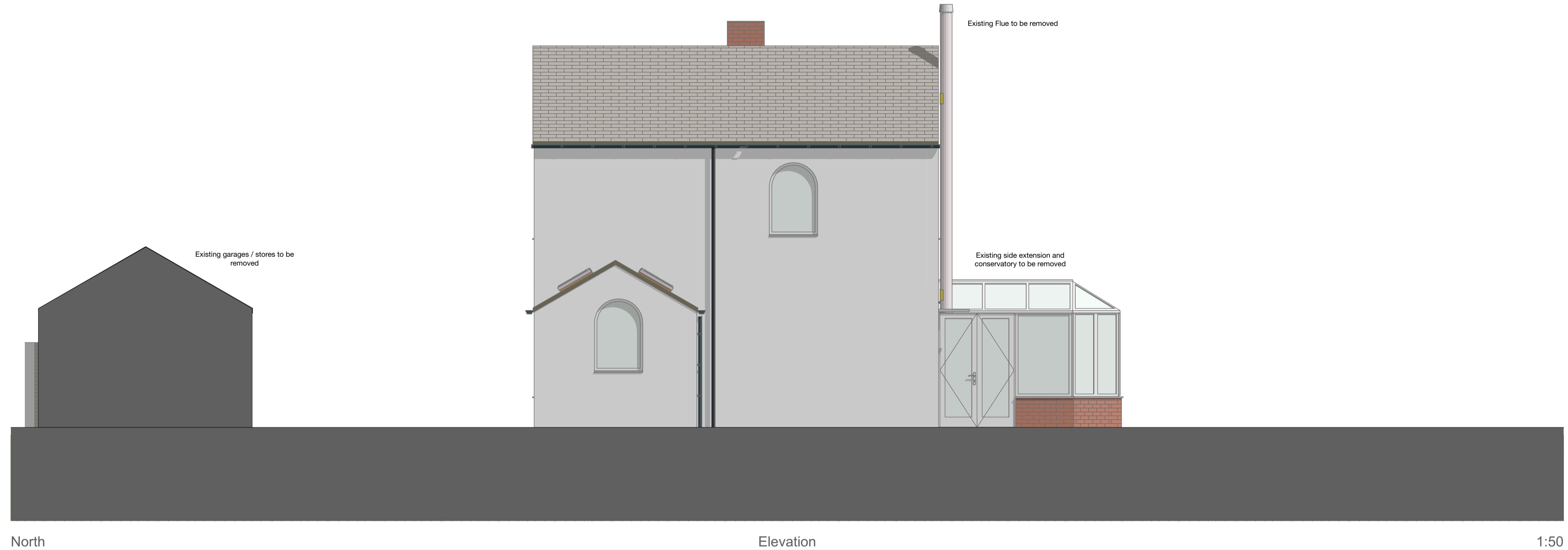
North Elevation 1:50