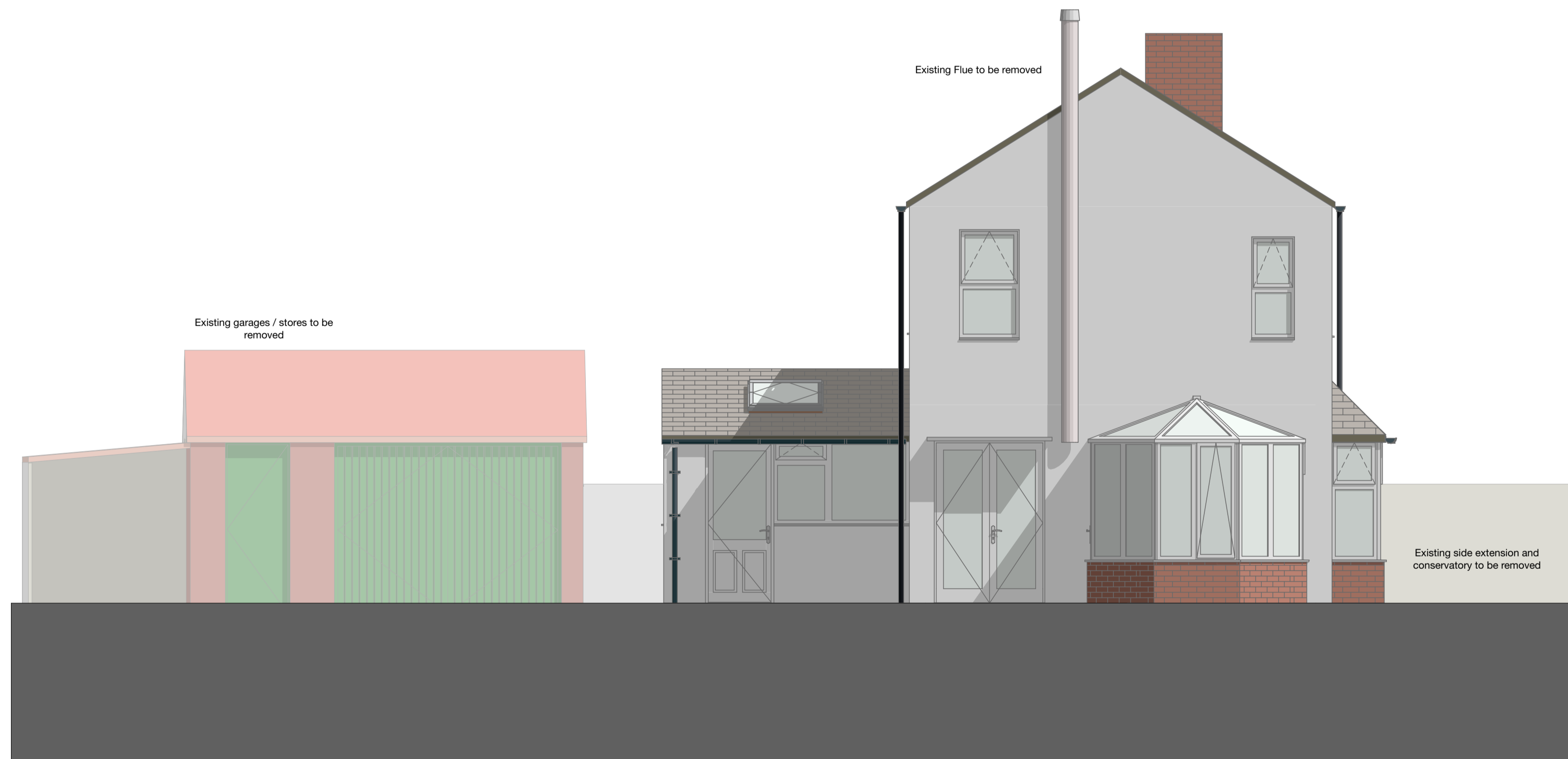
West Elevation 1:50