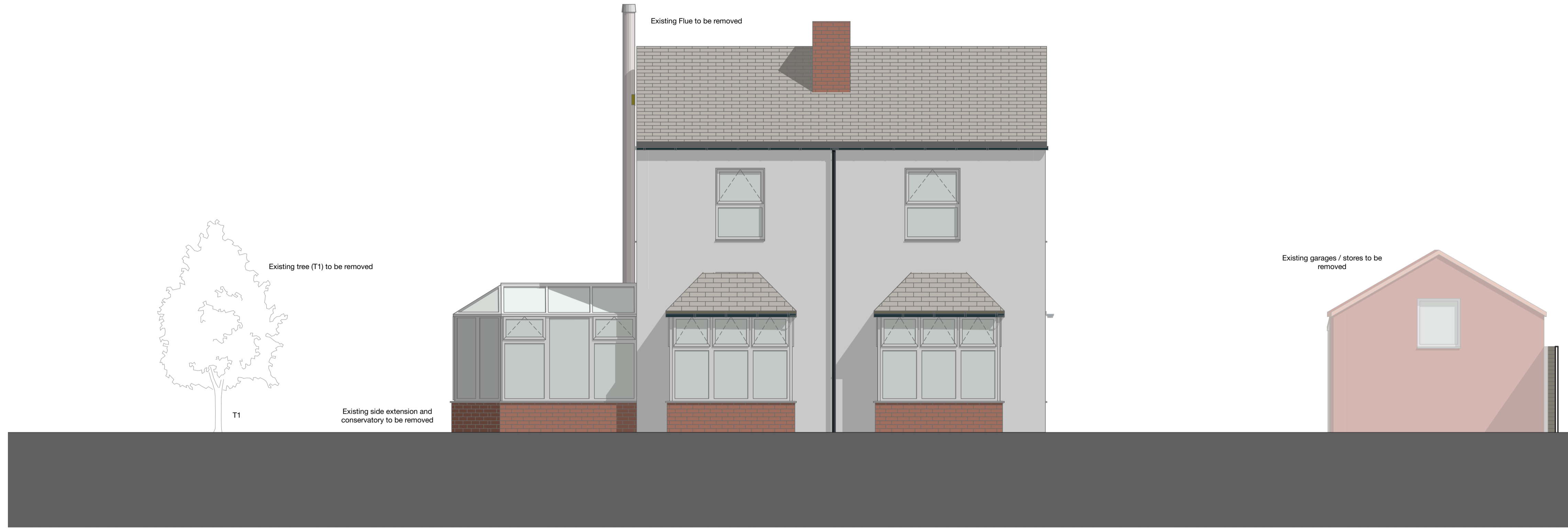
South Elevation 1:50