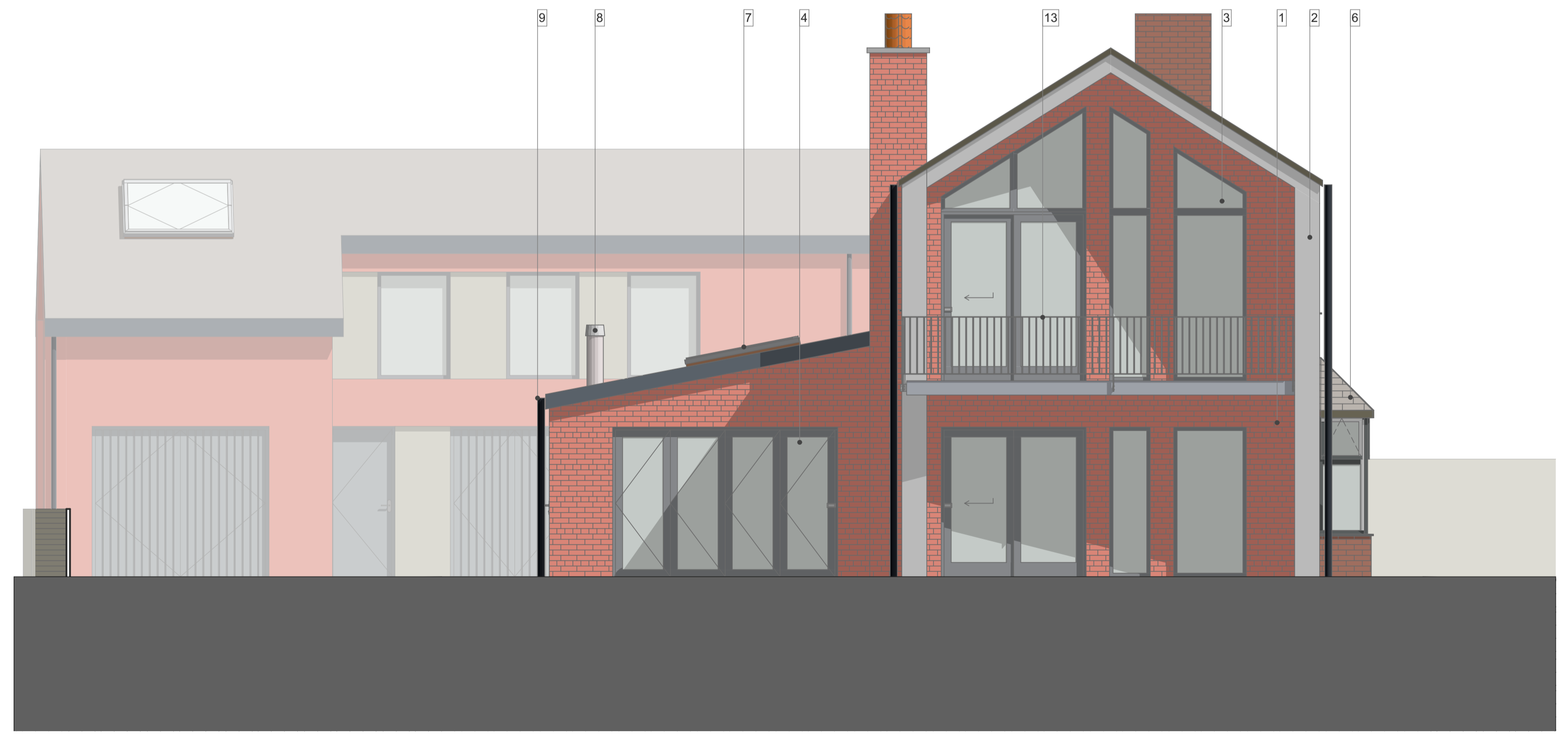
West Elevation 1:50