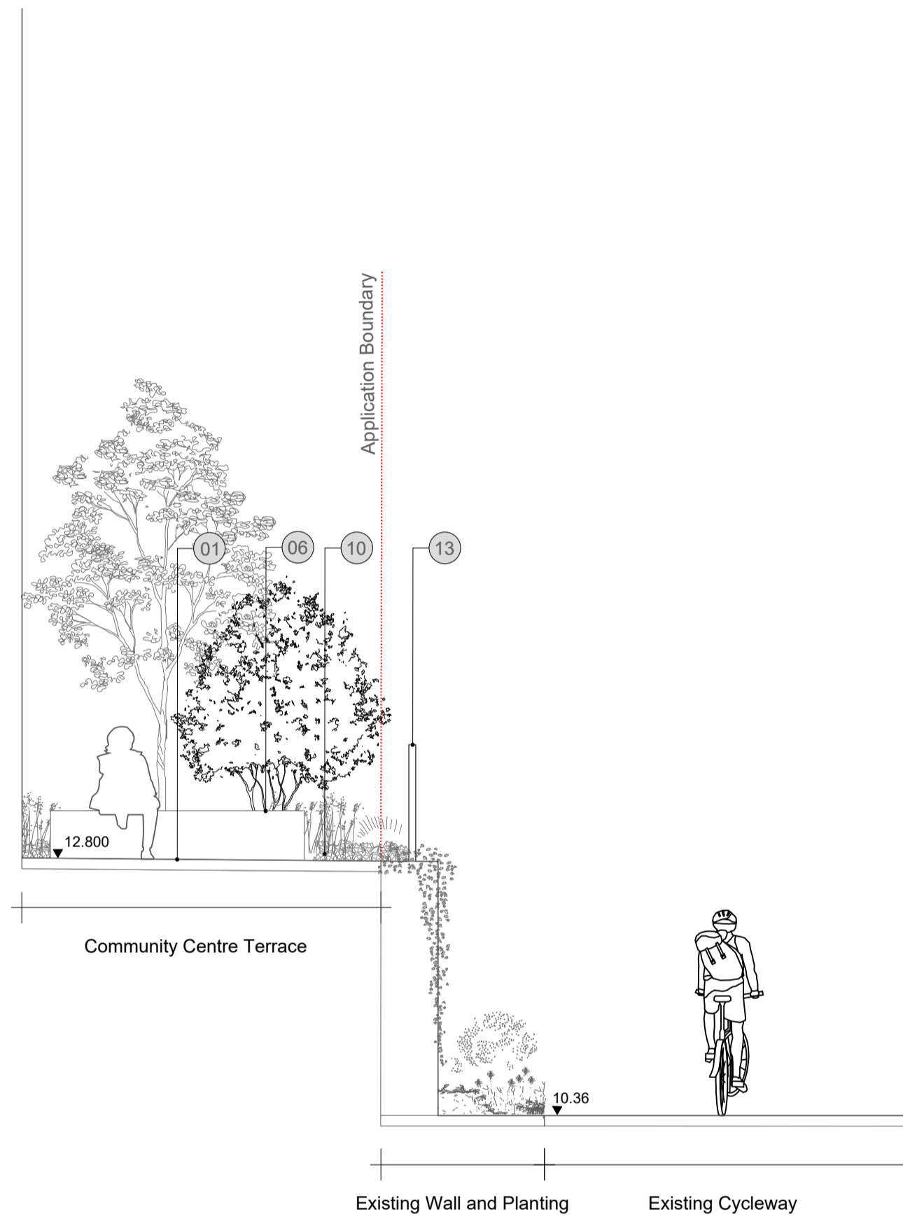
Section A: Through Community Center Terrace