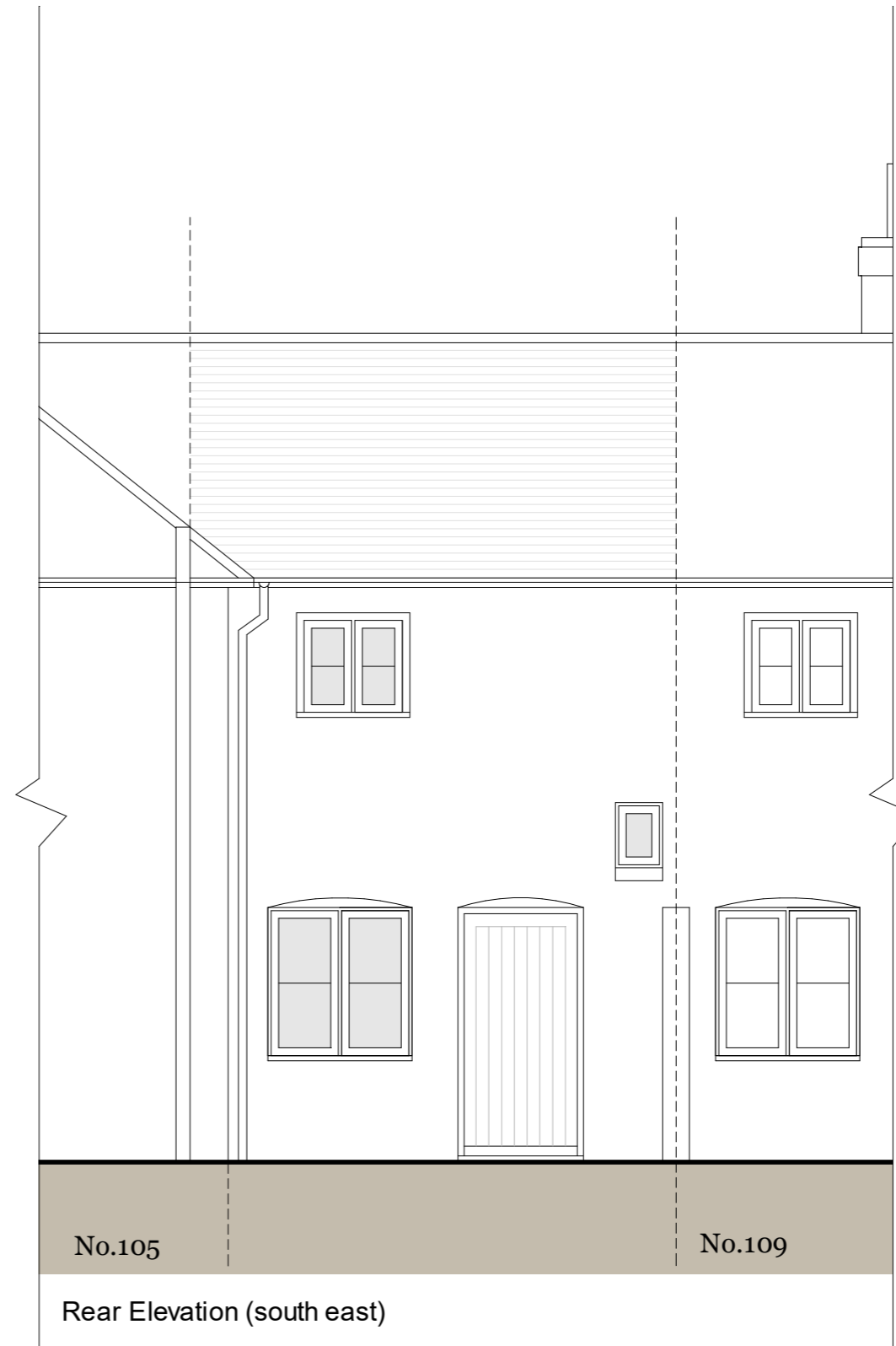
Rear Elevation (south east)